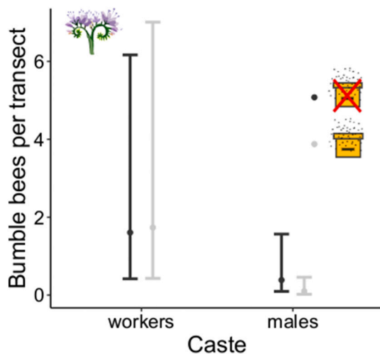
Fig. 2. Analysing caste abundances only in sites with flower strips, males were more abundant in sites with honey bee hives removed. Each transect was 50 m 2 . Black bars denote control sites with honey bee hives removed and light grey bars denote sites with honey bee hives added. Error bars indicate 95% confidence intervals.