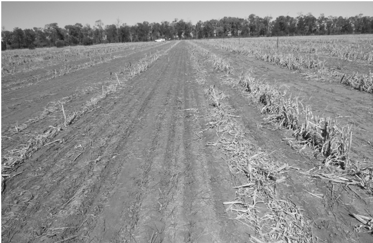
Figure 1. Residual stubble at the Yagaburne site at emergence of the winter cover crop and undisturbed on the right.

Two plot header runs were taken for each plot at this site: one over the previous sorghum rows and the other over the skip (Figure 1). There was a consistent yield increase for yield in header runs taken over the old sorghum rows when compared to runs taken over 'the skip row', with an extra 126 kg/ha yield measured on the old sorghum rows versus the skip (632 kg/ha vs 506 kg/ha).