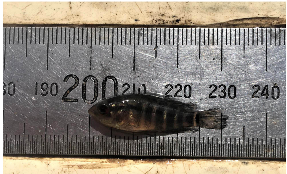
Figure 3. A 3.1 cm TL juvenile jaguar cichlid captured in fishway monitoring traps.

reportedly 30 non-native ornamental (aquarium) fish species known to have established in Australian freshwater ecosystems, and of these, only 10 (33%) of these are currently listed on the List of Specimens taken to be Suitable for Live Import (Moore et al. 2010). This “Live Import List”, made under Section 303EB of the Environment Protection and Biodiversity Act 1999 (EPBC Act), currently contains 260 freshwater fish species permitted for importation, even though an estimated 2000 species are currently traded. In addition to the illegal imports (approximately 5–10%; McNee 2002), there are “legacy” species that have been present in Australia for many years, some of which were once permitted under previous statutory arrangements. It is likely some of these legacy species have persisted as captive populations, despite technically no longer being permitted. There is also currently speculation among fish enthusiasts that progeny of these fish are legally able to be kept and traded, as they were here “prior” to changes in the statutory arrangements and implementation of the Live Import List. This is a common misconception, and in Queensland it is an offence under the EPBC Act, and the Queensland Biosecurity Act 2014 , to have any freshwater fish or invertebrate species or progeny of these species in possession that are not on the Live Import List. These are considered biosecurity matter in Queensland and fall under a general biosecurity obligation offence provision.