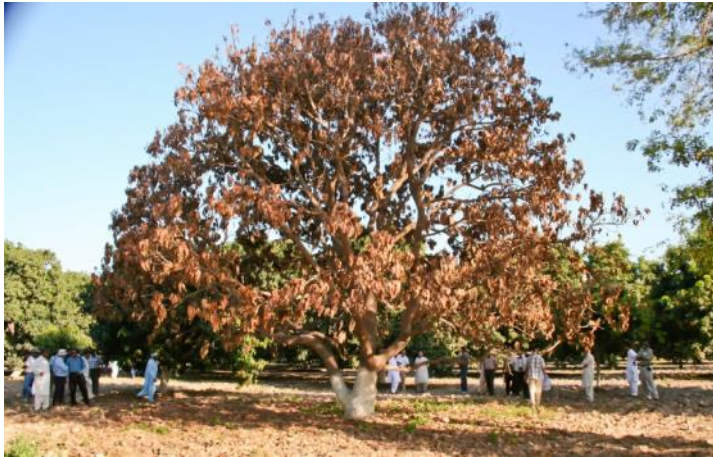
Figure 1. Mango tree killed by mango sudden death syndrome disease (MSDS)

Oman, had shown that the fungus Ceratocystis manginecans was involved in the syndrome (Van Wyk, et al. 2005; Al-Subhi, et al. 2006). From the initial scoping studies carried out in Pakistan (SRA/HORT/2005/154), the research team isolated Ceratocystis sp. from diseased samples from Punjab and Sindh orchards, reinforcing the findings of Malik et al (2005) that C. fimbriata or a related species was causing the disease. In follow-up research under ASLP 1 on the detection of MSDS, it