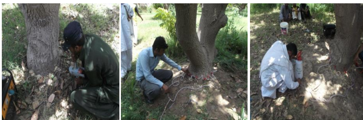
Figure 15. A simple pressurised macro injection system to apply fungicides in to the trunk of the tree to control mango sudden death. First holes are drilled in to the tree trunk, then nozzles inserted and the pressurised fungicide is applied through the nozzles.

A unique fungicide delivery system was developed by Mr Muhammad Tariq Malik, Pathologist from the Mango Research Institute in Multan, Punjab. This was a simple pressurised macro injection system that enabled injection of fungicide in to 4 or 5 injection points in the tree trunk simultaneously, speeding up treatment time and the time the tree needs to absorb the fungicide. The macro infusion system is now used in both Punjab and Sindh mango growing districts.