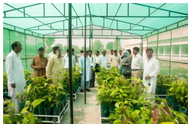
Figure 7b. New Research Nursery at Sindh Agricultural Research Institute built to ASLP nursery guidelines.