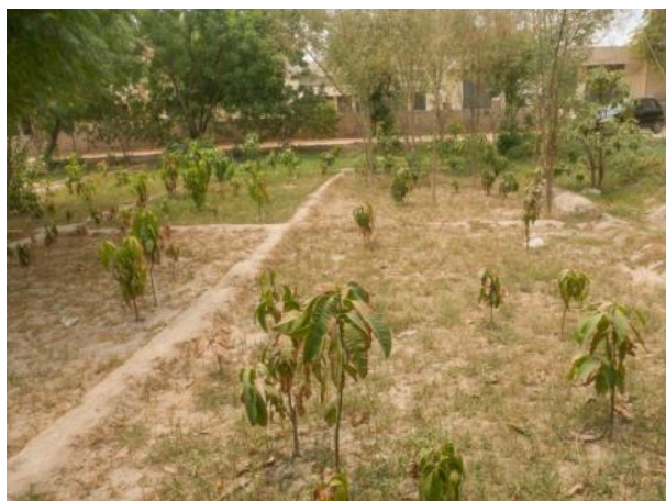
Figure 7a. Research Nursery at Sindh Agricultural Research Institute prior to the ASLP project.

The project established modern containerised nurseries at the major mango research stations in the Punjab (Mango Research Station, Shujabad, Bahauddin Zakaraya University, Multan and Mango Research Institute, Multan) and Sindh (Sindh Agricultural University, Tandojam, Sindh Horticultural Research Institute, Mirpurkhas, the Agricultural