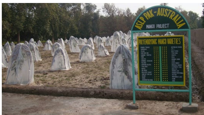
Figure 11. Imported monoembryonic rootstock growing in the field at Mango Research Station, Shujubad, with winter frost protection.

The project engaged in a search for more suitable rootstocks for the Pakistan mango industry. Traditionally mangoes have been grafted on to 'desi' varieties (small fruited local varieties) or on to the major commercial varieties. All of these rootstocks have monoembryonic embryos and have no specific abiotic tolerance. Seedlings grown from monoembryonic cultivars will not be genetically uniform and as such be unpredictable on their effects on scion varieties. To overcome the lack of polyembryonic cultivars available in Pakistan, 43 polyembryonic cultivars were imported from Australia in ASLP Phase 1 project. Fourteen of the imported cultivars did not survive the acclimatisation process, leaving 29 for evaluation. By late 2015, 11 of the imported polyembryonic varieties had cropped and were undergoing embryo, graft compatibility and tree vigour evaluation.