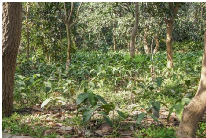
Figure 4. Traditional mango Nurseries are grown under the canopy of orchard trees and are exposed to soil borne and areal diseases such as mango sudden death and mango malformation.

Another major aspect of disease management is the production of nursery stock free of diseases such as mango malformation, sudden death and bacterial black spot. Nursery trees are generally produced by the private sector in Pakistan with little care for tree quality. Traditional mango nurseries operate well below best-practice and are contributing to low productivity in these industries. They frequently use poor quality, diseased propagating materials and plant these in local soils that are also infected with diseases that reduce tree health and lower tree productivity. Many traditional nurseries are responsible for spreading and perpetuating tree diseases such as mango malformation and for spreading infections to previously clean orchards.