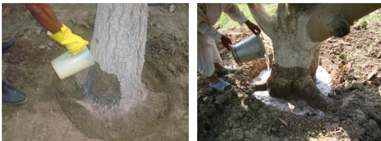
Figure 14. Application of plant growth regulator paclobutrazol as a trunk drench. A.) applying the paclobutrazol in 1 litre of water and B.) watering-in after application.

Nitrogen and plant growth regulators - A key finding from the orchard management research undertaken by Mr Ghaffar Grewal, of the Mango Research Station, Shujabad, Punjab during this project was the optimal rate and timing of nitrogen and the plant growth regulator paclobutrazol to mangoes to ensure tree canopies renew and are ready for flowering every year. Prior to this research work most Pakistan farmers applied nitrogen to their trees during the fruit development. This practice had negative effects on the fruit quality and subsequent vegetative flushing and flowering. The research work of this project found that application of nitrogen in the postharvest period increased the number of flowering terminals and yield in the following season, without negatively affecting fruit quality or shelf life. The research also confirmed that nitrogen application at flowering reduced fruit shelf life by increasing the fruit's susceptibility to postharvest rots. The research found that paclobutrazol applied at 40-50 ml per tree with 500 to 1000 g N improved flowering to between 63% and 77% and gave a regular yields of 256 – 306 Kg per tree over a 4 year period. The extension pamphlet “Use of paclobutrazol (PBZ) in mango orchards” was developed to outline the procedure of PBZ to for farmers (Appendix 3).