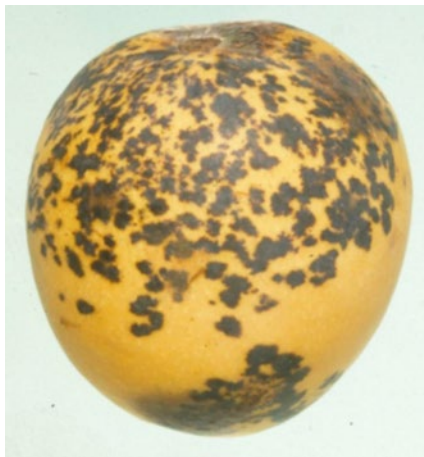
Figure 5. Symptoms of Dendritic spot disease on ripening fruit

Dendritic spot is a relatively new postharvest disease of mango that has emerged in Australia, in recent years. It was identified by more than 60% of growers in a 2007 survey as a major constraint to Australian mango industry development. The sporadic and unpredictable nature of this disease has resulted in a decrease in market confidence because the disease symptoms only manifest themselves as the fruit ripens, at which time nothing can be done to address the problem. A John Allwright Graduate Student Fellowship was secured to research dendritic spot disease to understand more about its causes and the conditions for spread of this disease.