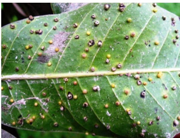
Figure 2. Leaf galls caused by mango midges, Diptera cecidomyiidae

Mango midges, Diptera cecidomyiidae are significant pests of mango in Pakistan and other parts of the world (but not in Australia) and infestation can decrease yield by up to 65%. There are 16 known species of gall midges that infest mango throughout Asia. Midge symptoms include curling and drying of leaves, galling of leaves, shrivelling of new growth and fruit drop. At the beginning of this project (ASLP2) little was known of the different species of gall midges and their lifecycles in Pakistan making management of the pest difficult.