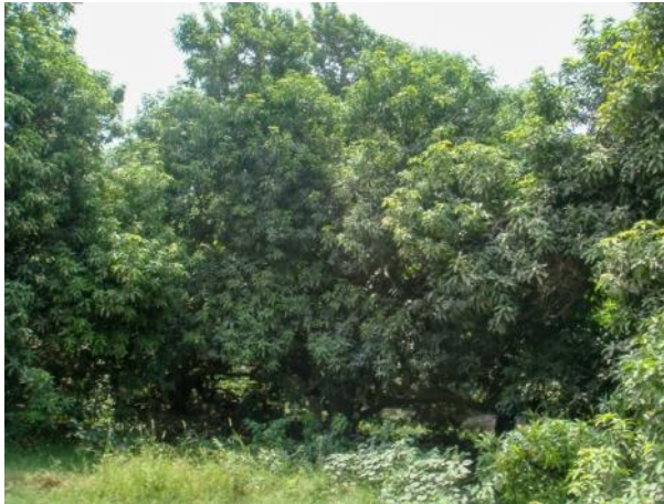
Figure 3. Traditional orchards that have never been pruned, exclude light and have low yields

The impact on productivity of poor canopy management is also a significant constraint to farm productivity and profitability. Little or no pruning of trees has caused long term yield decline due to poor flowering and insufficient light penetration through the outer canopy. Better tree management in conjunction with improved plant nutrition and irrigation linked to tree phenology cycles are critical components of an improved orchard management system. Research station trials were initiated during ASLP 1 to develop better management practices and to demonstrate to farmers that these practices can lead to increased productivity, quality and profitability.