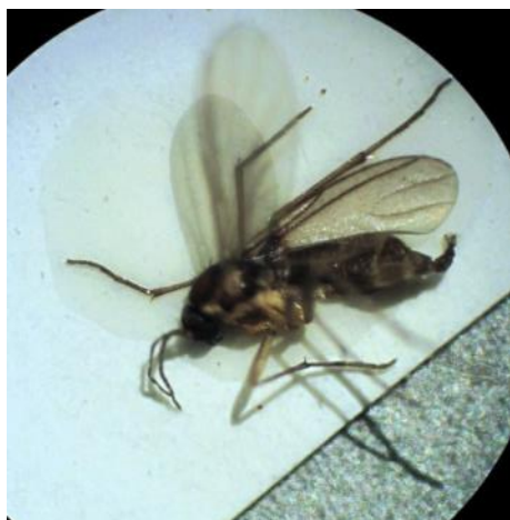
Figure 18. Leaf gaul midge, IProcontarinia spp.

Species identification - The project identified six different species of gall midges in