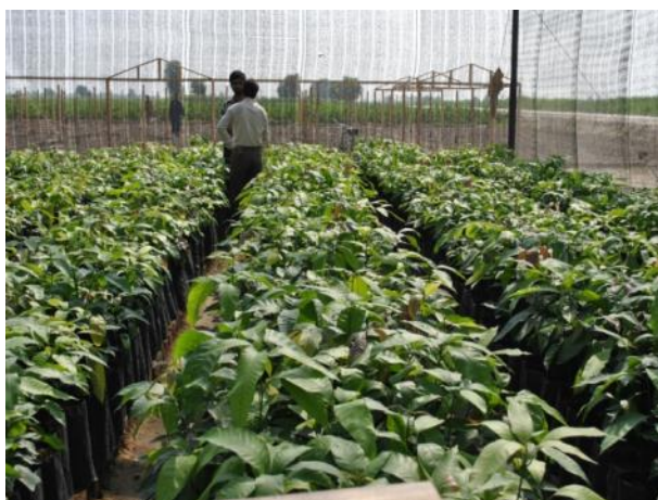
Figure 8. MAK Nursery, Sadaquabad was one of the first privately owned commercial mango nurseries growing containerised trees using ASSLP guidelines.

During the project, considerable effort was given to supporting the new nursery businesses in their early years resulting in strong Government and private industry linkages.