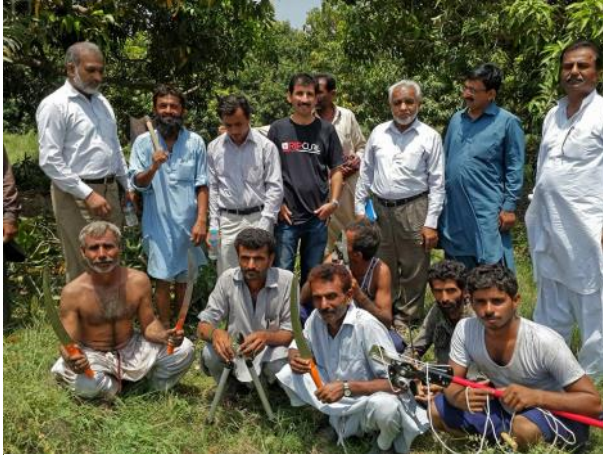
Figure 19. Farmer field school on pruning of mango orchard held on a Sindh farm cluster.

The benefits to growers and others in the value chain of ASLP management recommendations was enhanced by adopting a cluster approach with demonstration orchards. The cluster approach uses collaborating farmers' orchards as demonstration plots. The demonstration farms are usually village based and surrounded by other similar sized farms. The cluster farms become the focal point for ASLP training and the site for research and surveys. This approach uses the natural social interactions within a village to disseminate information as well as formal training of farmers in the farmer field school style. There have been several successful clusters in the project with clusters considered ideal for studying and understanding adoption pathways.