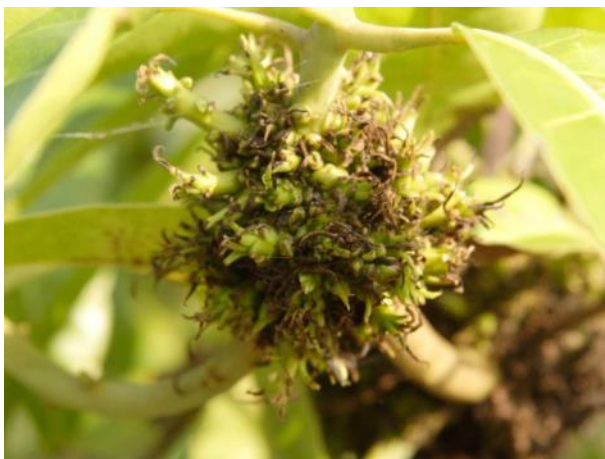
Figure 17. Mango Malformation

Species identification - Internationally there are many Fusarium Spp. associated with