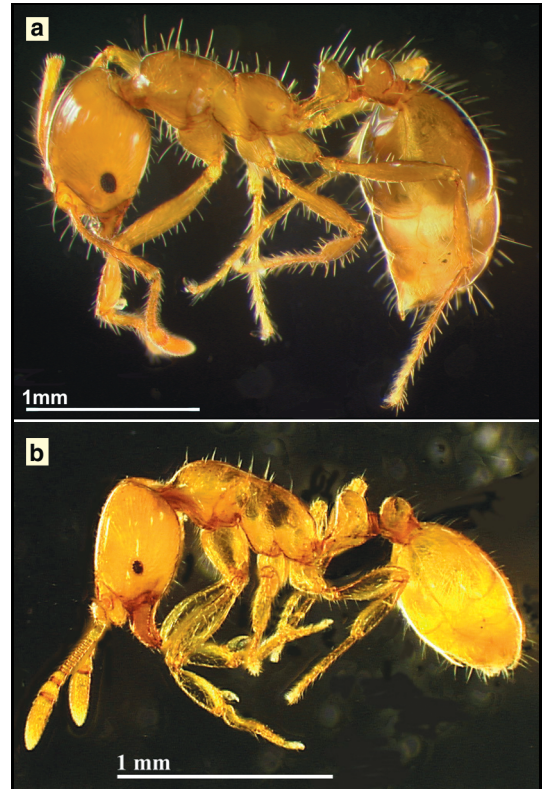
▲ 1: (a) The Red Imported Fire Ant (Solenopsis invicta), and (b) Monomorium sp., a harmless native ant, demonstrating the similarity between the two species.