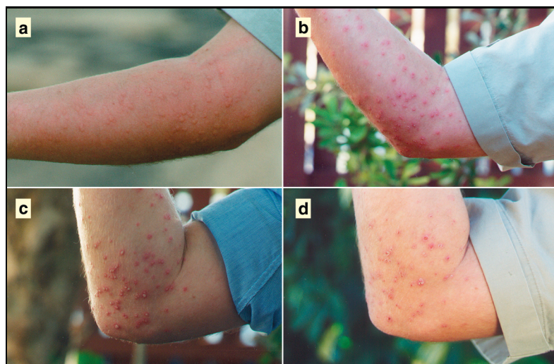
◀ 3: Multiple stings (about 150) by S. invicta to the right arm of one of the authors (C V) as a result of accidental exposure in the field. (a) Five minutes after the event, showing raised welts at sting sites; (b) 18 hours after, showing typical pustules; (c) 48 hours after; and (d) seven days after the event.