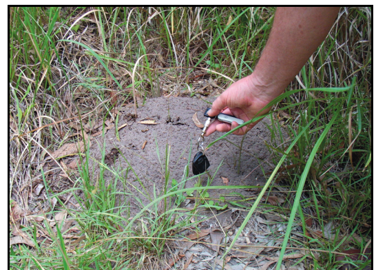
▲ 2: A typical Red Imported Fire Ant mound.