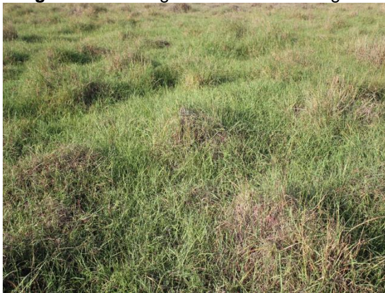
Image 3. Reddening of leaves on Creeping blue grass.