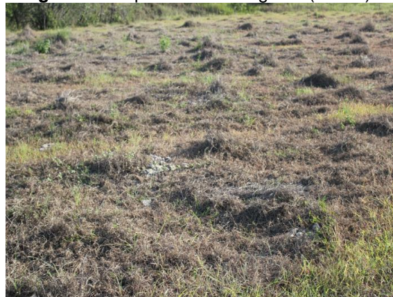
Image 4. Dead Creeping blue grass patch.

The impacts of pasture dieback are the same across all affected grass species, including: