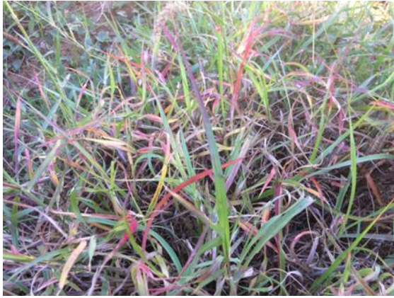
Image 1. Reddening of leaves on Buffel grass.