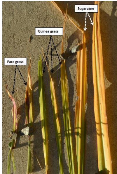
Image 5. Dieback symptoms in Para grass, Guinea Grass and YCS symptoms in sugarcane.