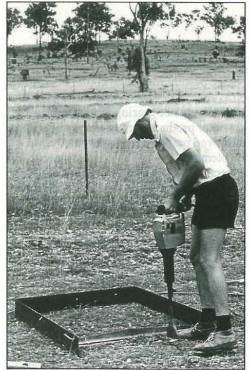
Plate 2. Setting up for the rainfall simulator—the hard soil conditions make a jackhammer necessary.

For contour chisel ploughing to be viable, the extra water conserved has to be turned into extra grass production. Increases in production of up to 100% were shown (mainly on Queensland blue grass ( Dicanthium sericeum ) and pitted blue grass ( Bothriochloa decipiens )). Areas that were completely bare before chiselling also regenerated well compared with non-chiselled sites.