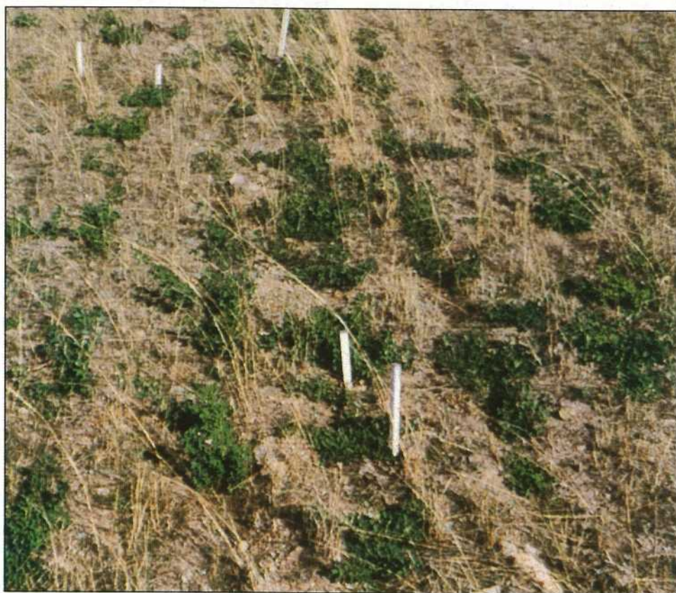
Plate 1. Legume plots recover after crash grazing in early May.