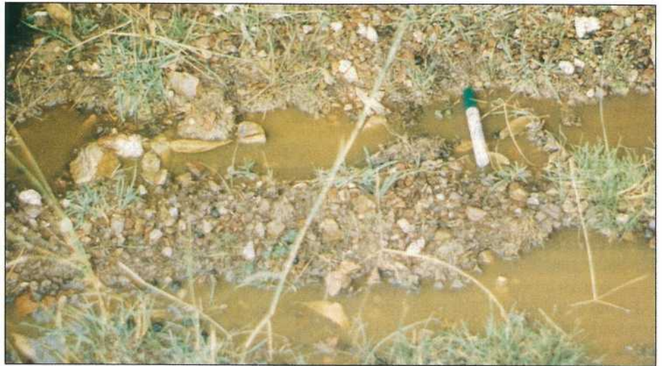
Plate 4. Chisel furrows holding runoff after simulated rainfall.

Contour chisel ploughing will reduce total runoff and sheet erosion, particularly in overgrazed pasture. The speed in which gullies cut back will also be slowed and the chance of them regenerating through simple techniques