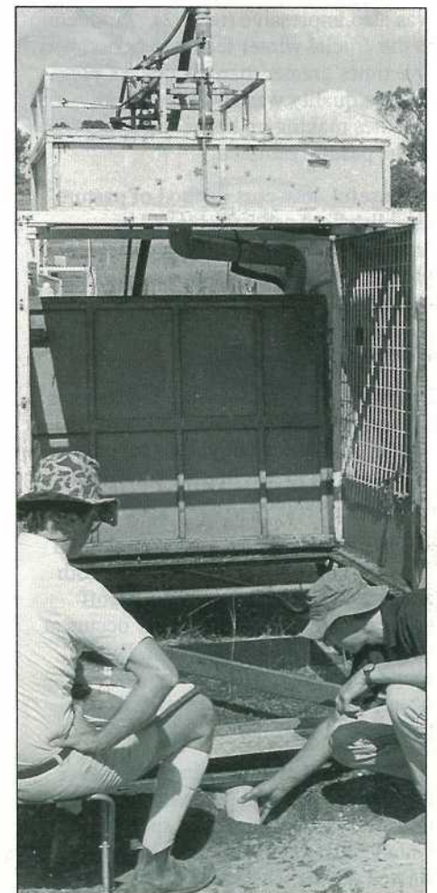
Plate 3. Operating the simulator.