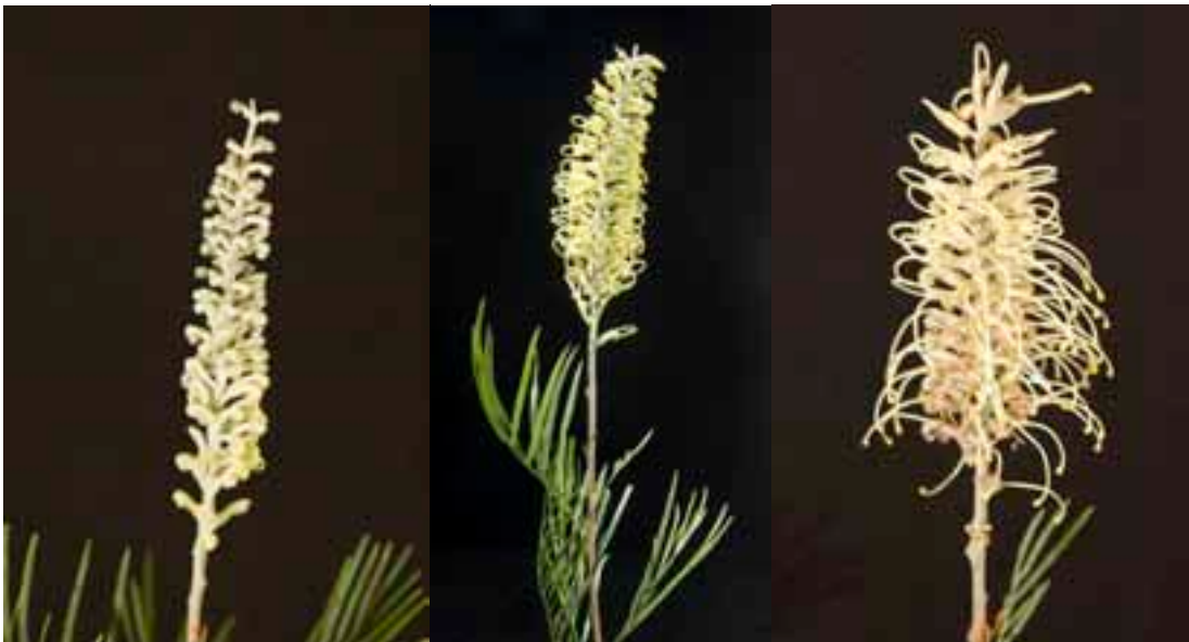
Figure 7. Considerable time was needed to assemble high quality photos of all maturity stages and typical defects. These photos show grevillea flowers at 3 different maturity stages, ranging from immature (left), ideal to market (centre) to overmature (right).

Considerable time was needed to assemble high quality photos of all maturity stages and typical defects. Due to the short flowering season of many of the products, the researchers had to work quickly with growers and marketers to collect enough samples for all photos needed. Samples for photography were sourced from twenty farms in NSW, Qld, SA and WA, and from wholesalers at the Sydney Flower Market. Several growers provided significant support to the project by posting flower samples at varying stages to the researchers so these could be photographed.