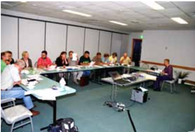
Figure 4. Grower workshops were used to gather information and build understanding of the specifications and how they can be used.