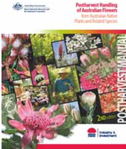
Figure 8. A new and appealing cover was designed for the postharvest manual.

To make the manual relevant, interesting, clear and accessible, it was edited by a technical editor. All photos included are in colour and new images and diagrams have been added where necessary. All are lodged in the photo library of I&I NSW.