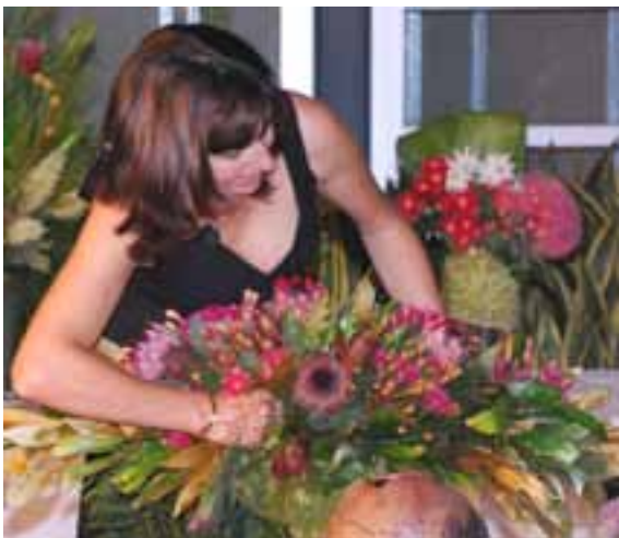
Figure 1. Florists enjoy working creatively with Australian wildflower products.

The important outcomes of this project, the thirty-two quality specifications and the revised postharvest manual, are published separately. Therefore this report is only a brief summary of what was done, what is in the specifications and the manual, the conclusions we've drawn from the project and our recommendations.