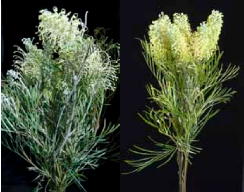
Figure 10. The wildflower quality specifications aim to remove poor quality products like this grevillea bunch (left) from the marketplace and ensure buyers receive good quality flowers at the correct maturity stage (right bunch).