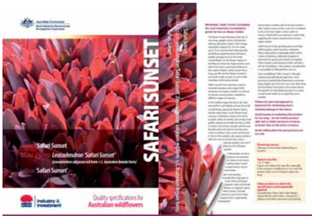
Figure 9a. Sample specification for Leucadendron 'Safari Sunset' – cover and page 2 giving product introduction.