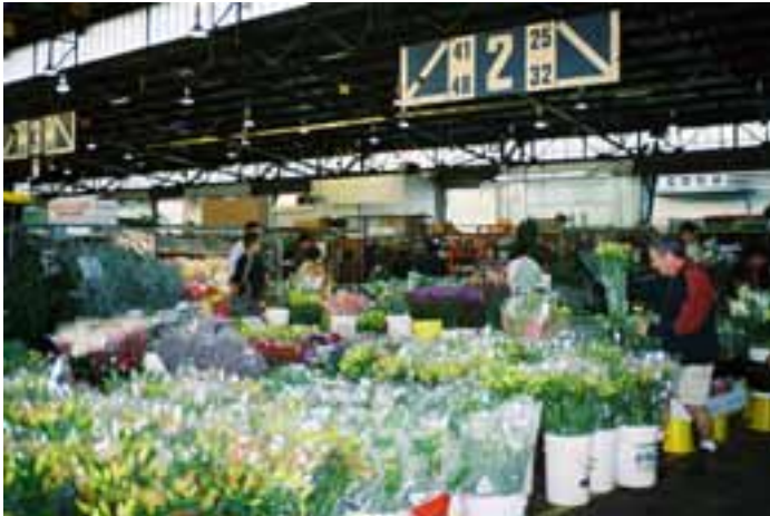
Figure 2. Wildflowers are traded in many Australian domestic markets, alongside traditional flowers. However, they have some unique features requiring specific postharvest management.

Existing product standards or specifications were identified and reviewed.