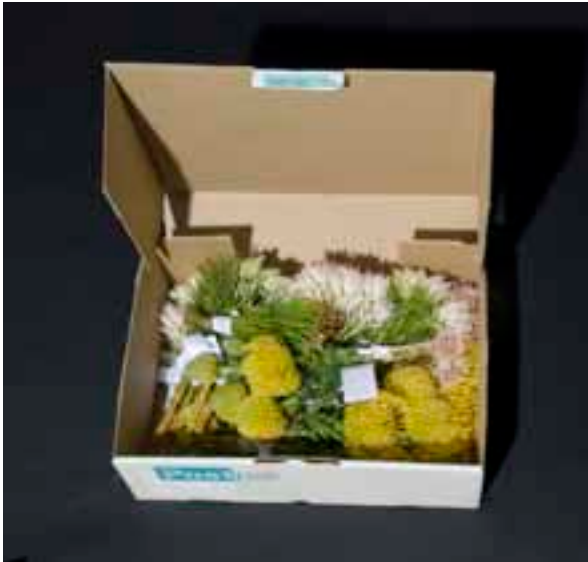
Figure 6: Many growers contributed to the project, some by posting samples for photography to the researchers.

Considerable time was needed to assemble high quality photos of all maturity stages and typical defects. Due to the short flowering season of many of the products, the researchers had to work quickly with growers and marketers to collect enough samples for all photos needed. Samples for photography were sourced from twenty farms in NSW, Qld, SA and WA, and from wholesalers at the Sydney Flower Market. Several growers provided significant support to the project by posting flower samples at varying stages to the researchers so these could be photographed.