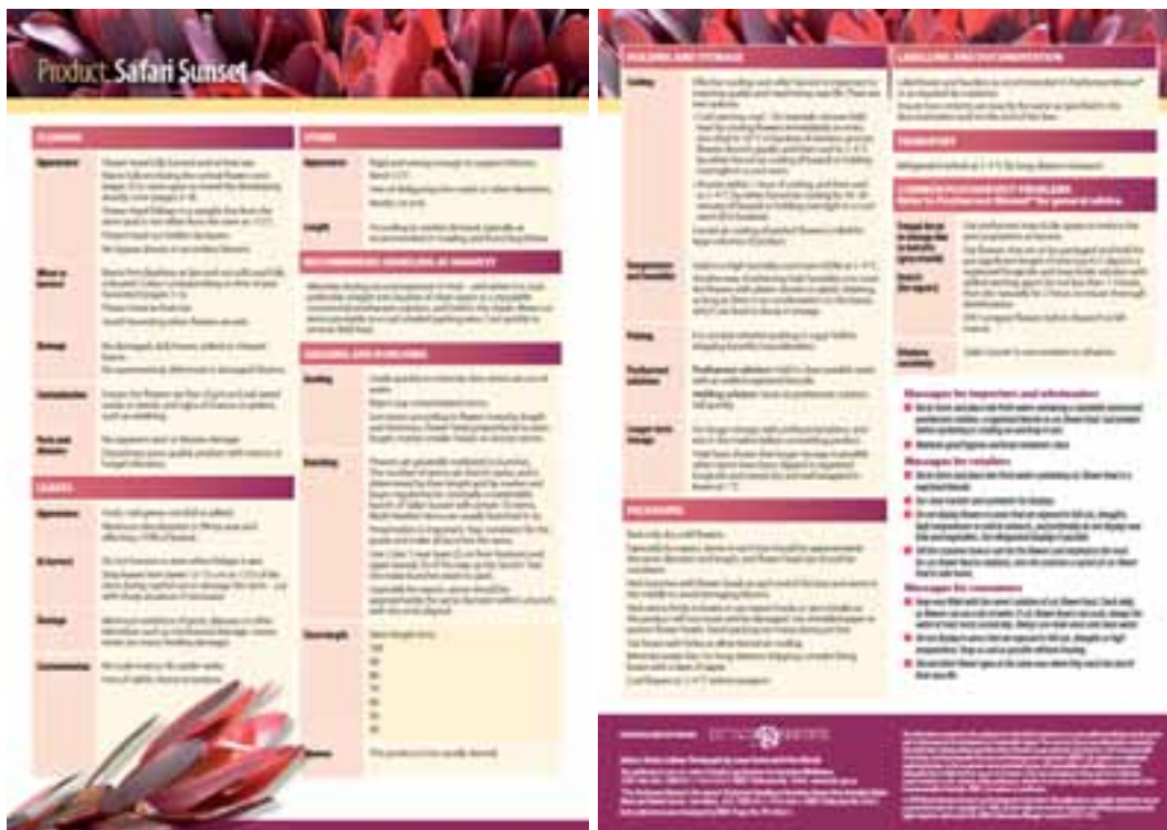
Figure 9c. Sample specification for Leucadendron 'Safari Sunset' – pages 5 and 6 showing charts describing product appearance, plus handling, storage, packaging, labelling and transport advice, details of common postharvest problems and messages for others in the chain – marketers, retailers (e.g. florists), consumers.