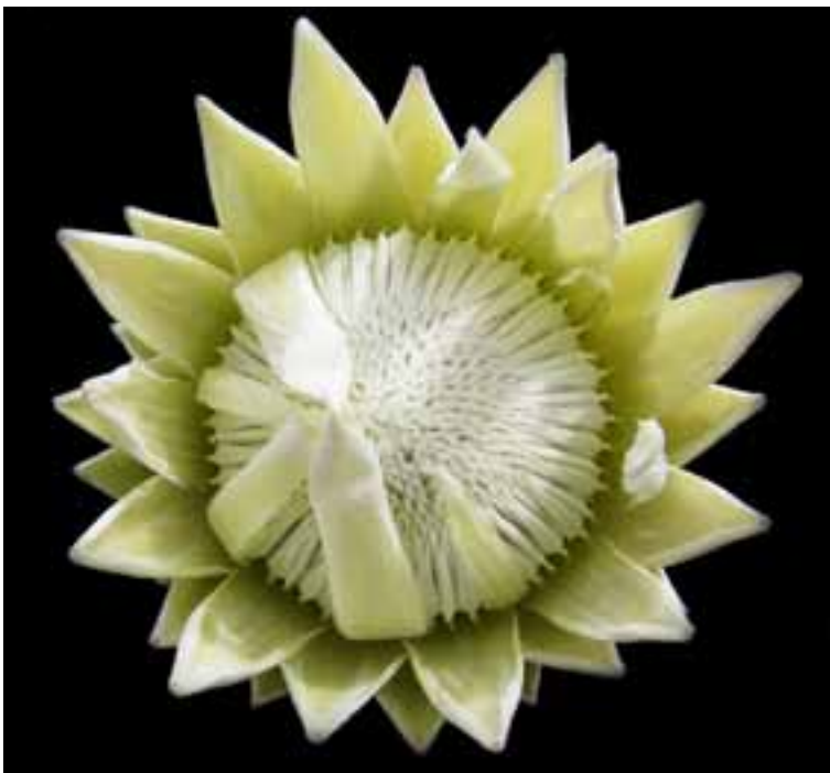
Figure 11. Correct postharvest management requires a good understanding of the unique features of wildflowers. The spectacular king protea is an example of a complex flower head composed of hundreds of individual florets surrounded by attractive bracts.

This creates the potential for postharvest issues not encountered with other types of flowers. For example as the florets in a complex flower head (seen in Banksia , Protea , Leucospermum and Grevillea ) develop and open, they draw on food reserves in leaves, they produce nectar (which in turn attracts birds and bees) and the appearance of the flower head changes completely. These attributes need to be managed by the grower and/or the marketer to avoid major postharvest problems that will reduce quality and marketability.