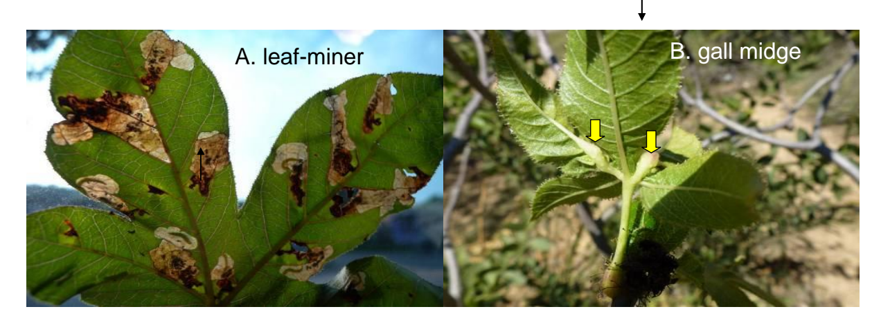
Figure 2. Damage by the leaf-miner (A) Peru and the gall-midge (B) in Bolivia.