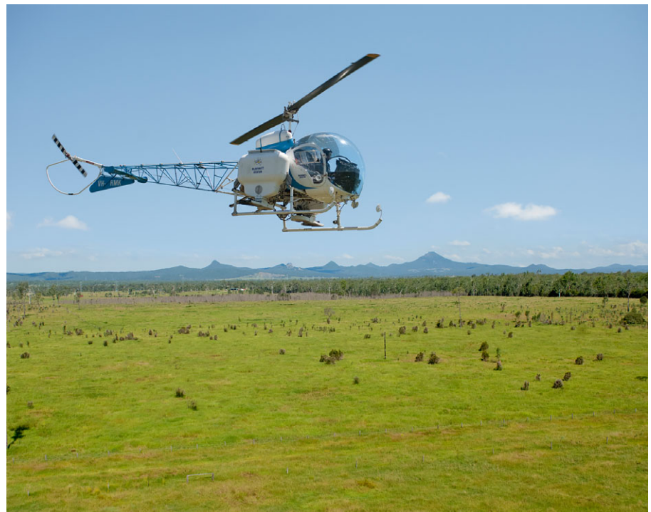
Figure 1. Red Imported Fire Ant readily invades open and disturbed land in both urban and rural areas. Here, a helicopter is using remote sensing to detect potential mounds in grazing land west of Brisbane.