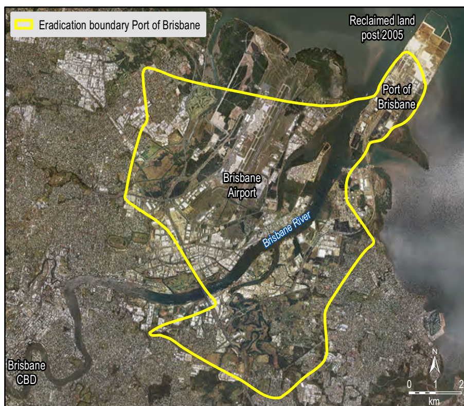
Figure 5. Boundary of eradication of the 2001 Port of Brisbane incursion; the known infested area is 8300 ha.

(Box 1). Continued use of odour detection dogs provides verification that treated areas are free of Red