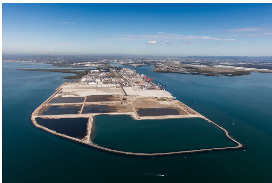
Figure 3. Port of Brisbane, the site of the 2001 incursion of Red Imported Fire Ant. Reclamation works in the foreground are post-2005.

showed the presence of a small number of polygyne (multiple queen) colonies; these polygyne colonies were genetically distinct from the Richlands polygyne colonies, with allelic similarities to the monogyne population present at the Port of Brisbane.