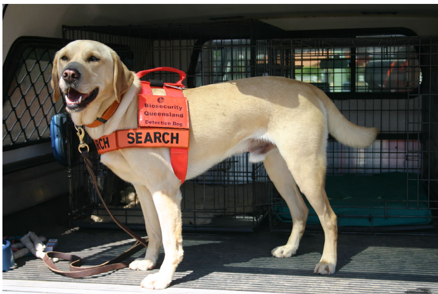
Figure 6. Red Imported Fire Ant odour detection dog 'Clancy' in field harness.