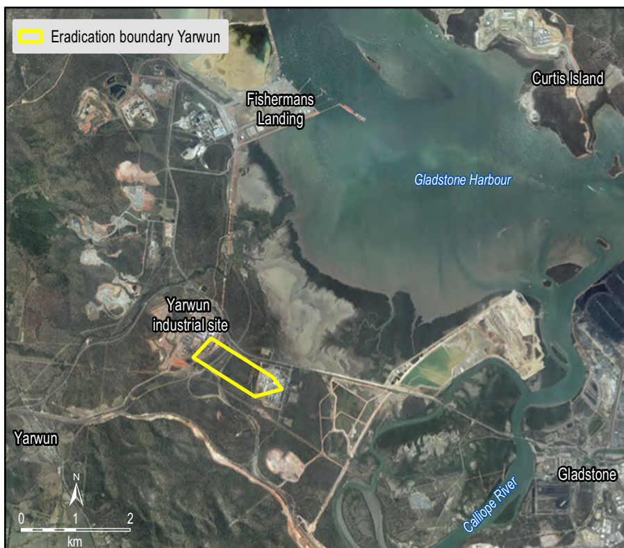
Figure 7. Boundary of eradication of the 2006 Yarwun incursion; the known infested area is 71 ha.

foraging ants were detected. Genetic analysis showed that all Red Imported Fire Ant samples from Yarwun were single queen (monogyne) colonies,