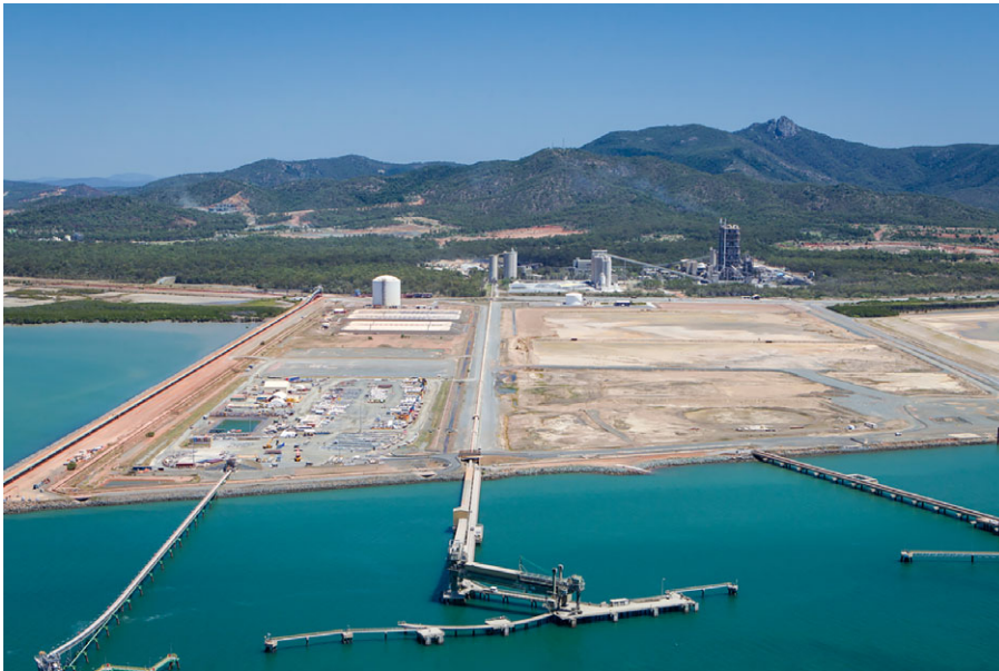
Figure 8. Port of Gladstone, Fisherman's Landing, the site of the 2013 incursion of Red Imported Fire Ant.

about this in the literature (Myers et al. 1998). The previous largest eradication of an ant worldwide was a 300 ha infestation of Argentine Ant, Linepithema humile (Mayr), in Western Australia (Van Schagen et al. 1994; Hoffmann et al. 2011). By comparison, the Port of Brisbane infestation was 8300 ha.