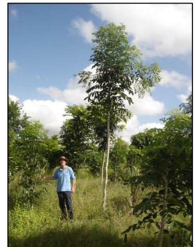
Figure 2. A rooted-cutting tree (ramet) (age 22 m) of Queensland Clone 1 in a replicated, single-tree-plot trial of 56 clones near Ingham, Queensland. Clone 1 (nine ramets, mean height 6.3 m at age 3 y) was the tallest in the trial.

This collaborative trial of government clones was planted on company land at approximately 18°28'S, 145°58'E, 80 m a.s.l., MAR 1583 mm on a Brown Kandosol soil. Initial stocking was 1250 s ha -1 . A randomised complete block (RCB) design was used with 11 replications of 80-tree blocks and non-contiguous single- or multiple-tree plots to cope with variable numbers of ramets per clone (2–31); those with >11 ramets had >1 ramet in some or all replications. Entries included 56 rooted-cuttings (ramets) clones comprising 55 from a sample of the clonal hedges established in Qld from cuttings transferred from the NT hedge garden, and a single Qld clone derived from basal coppice on a 'plus' tree of outstanding height, good diameter and above-average straightness selected at age 3 y in a stand in coastal north Qld. Controls were Burkina Faso and Darwin seedlings; each had 10 or more seedlings per replicate. The trial was measured at age 2.3 y for DBH and height and scored for straightness (1–6, 6 = best). The trial was strongly impacted by Tropical Cyclone (TC) Yasi at age 2.7 y. The strength of the winds at the site exceeded 163 km hr -1 (Category 2–3). At age 3.0 y the trial was re-assessed for the above traits and also for apical persistence (a surrogate for 'merchantable height' on a scale 1–6, 6 = best) and 'lean' (1–5, 1 = best). The 2.3-y assessment of straightness was considered the more reliable. There were statistically significant differences for