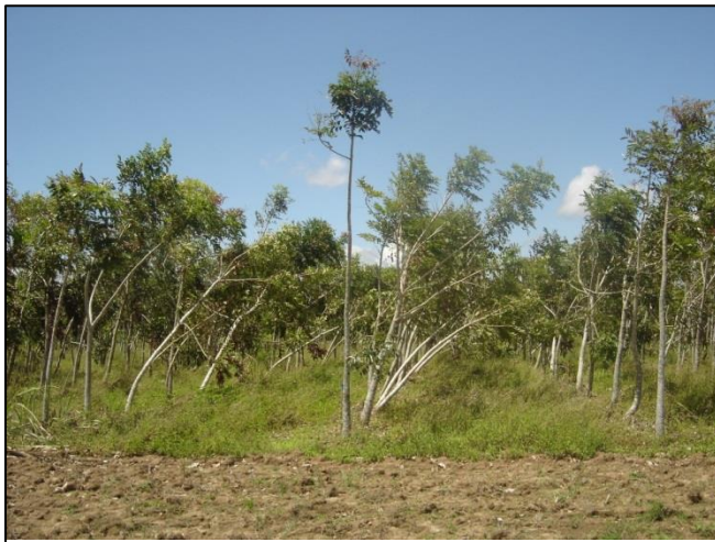
Figure 3. African provenance trees (age 2.8 y) near Ingham, Queensland after being impacted by Tropical Cyclone Yasi (Category 2–3). Note the erect central tree, exhibiting no stem damage in the midst of damaged cohorts.

and b) central ( 0^{\circ} to 20^{\circ} E), viz. Cameroon (5); and varying numbers of Australian landraces (Darwin, one or two; and Kununurra, WA, two or three in the respective trials). Initial stocking was 1250 \text{ s ha}^{-1} in both trials. RCIB designs with four replications of 60-tree, multi-row plots were used. The Qld trial was impacted by TC Yasi at age 2.8 y in February 2011 and was damaged severely (Fig. 3). The trials were assessed at age 3 y for several traits – height, DBH and straightness at both sites; branch thickness in the NT only; and axis persistence, lean and diseased trees in Qld only (Dickinson et al. in prep.). Both country of origin and provenance had statistically significant effects for all traits assessed at each site: P < 0.001 for both country and provenance at both sites for height and DBH, and for provenance straightness and diseased trees at the Ingham site; and P < 0.01 or P < 0.05 for all other trait combinations with country and provenance. Quoting from Dickinson et al. in prep, ‘Senegal and Guinea provenances performed best overall, with good height and diameter growth, straightness,