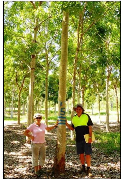
Figure 5. A private woodlot (age 8.5 y) at Moongobulla, south of Ingham, Queensland. The central, superior tree was selected for conservation and breeding.

Achieving genetic improvement requires a well-defined objective; knowledge of heritable traits, their correlations and relative economic importance; genetic resources with variability for these traits; and means to identify, capture and deploy superior material. The objective of Ks plantations in northern Australia is the production of high-value specialty purpose and appearance grade sawn timber and veneer products that attract high prices (Bevege 2004). For high recovery in processing young hardwoods from both thinnings and final crop logs, veneering is attractive relative to sawing (McGavin et al. 2014, Zbonak et al. 2014). Logs for veneering should have high small end diameter under bark with minimal sweep, taper, knots and out of roundness (McGavin et al. 2014). These qualities also apply to logs for sawing. Harvesting costs have a large impact on plantation profitability (M. Brown, University of the Sunshine Coast, 2014, pers. comm.) so growing fewer trees ha -1 could be more economical. Genetically-improved planting stock allows for the economy of lower initial stockings. A further challenge in Ks plantation management on short rotations is producing logs with early development and a high proportion of desirable deep red heartwood colour. Best results in a Ks plantation enterprise will come from integrating genetic and cultural approaches to improvement of crops.