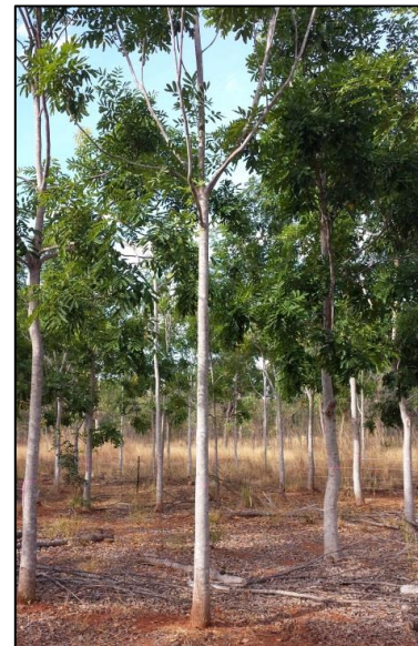
Figure 4. Cameroon provenance trees (age 6.5 y) in the Douglas-Daly, NT. Central tree DBH 13.5 cm (estimated). Note the variation between individual trees in height of unbranched bole, growth, form and branch characteristics.

Locations and environmental details for these trials on company land, established in collaboration with the Qld government, are similar to those given for the clone trials planted in the Douglas-Daly, NT in 2007 and near Ingham, Qld in 2008 respectively (Dickinson et al. in prep.). These trials included 38 provenances from five African countries of two broad regions across the natural range: a) western (west of longitude 0^{\circ} ), including Senegal (four provenances), Guinea (1), Mali (22) and western Burkina Faso (6);