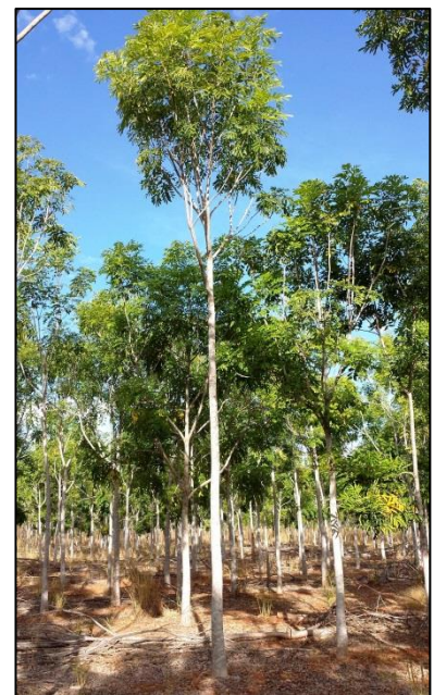
Figure 1. Senegal provenance trees (age 6.5 y) in the Douglas-Daly, NT. Central tree DBH 13.2 cm. Note the variation between individual trees in height of unbranched bole, growth, form and branch characteristics.

Ks is among the highest-value species in large, commercial timber plantations in Australia. Dried dressed Medium Feature to Select Grade timber sawn from 30-y-old plantation trees was judged in an industry survey in 2004 to retail for between A$3000 and A$5500 m -3 on the domestic market (Armstrong et al. 2007). Furniture crafted from it won state and national awards (Nikles et al. 2008). Twenty-year-old plantation trees produced wood well suited to specialty purpose and appearance grade sawn timber and veneer products (Zbonak et al. 2010). While future domestic and export market prices for clear-fall and