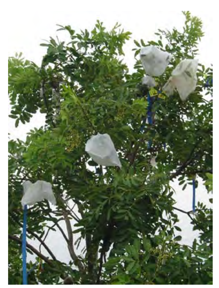
Figure 2. Flowers bagged for controlled pollination in 2011 in DAFF's clonal seed orchard at Walkamin Research Station, Queensland. G. Dickinson.

Ks has separate male and female florets within clusters on the same tree and appears to be insect pollinated (6). Flowering occurs during July-November (dry season) in the NT seed orchards and November-February (latter part includes two wet-season months) at Walkamin, Qld. Pods mature a year after flowering, each with c. 45 seeds, averaging c. 6000/kg. Flowering is highly synchronous among diverse clones, so extensive crossings are expected in seed orchards. Recent controlled pollination (CP) efforts (Fig. 2) have resulted in some seed; however, the technique needs refining (6). So far, the breeding program has used open pollinated seed from the CSOs and good trees in older plantings. It could use CP soon as superior parental and young trees are being identified (see Clone and Progeny tests below).