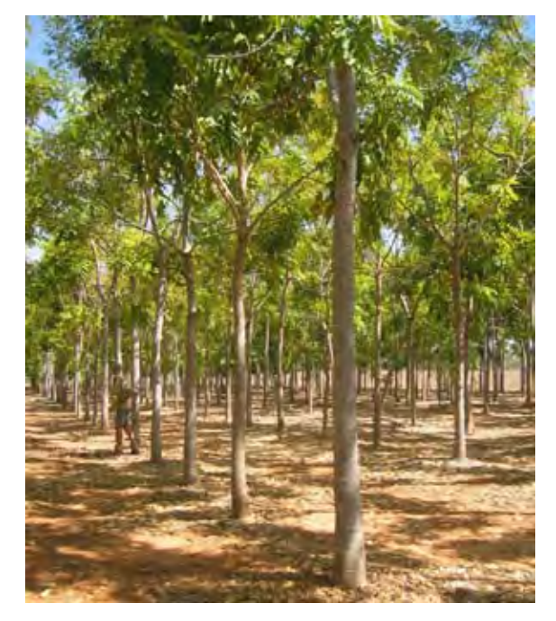
Figure 5. A stand of 5.3-year-old rooted cuttings trees in a replicated, single-tree-plot test of government clones planted on industry land in the Douglas-Daly, Northern Territory in 2007. DBH of largest trees: 20 cm. D. Reilly

Four trials planted in 2008 were assessed at age three years. Results indicate better growth from some African sources, while others exhibit better stem quality; statistically significant differences were also found for axis persistence, a canker disease and lean (cyclone effect) (22, 23). Several exceptional trees (age three) for good growth, bole length, form and low lean survived Cyclone Yasi at Abergowrie. This may indicate we can select effectively for traits including windfirmness as achieved with Caribbean pine in Qld (24). Provenance performance may change with age so trials need to be maintained long-term.