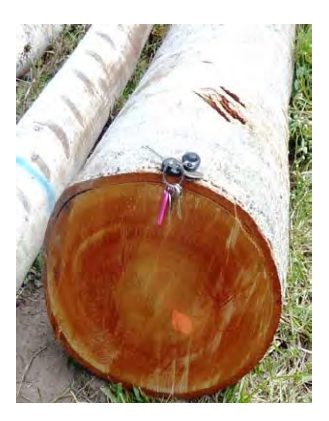
Figure 8. Logs from thinning of a 10-year-old, farm forestry stand in coastal lowlands north of Townsville, Queensland. Note the high proportion of dark-coloured wood of the log end.