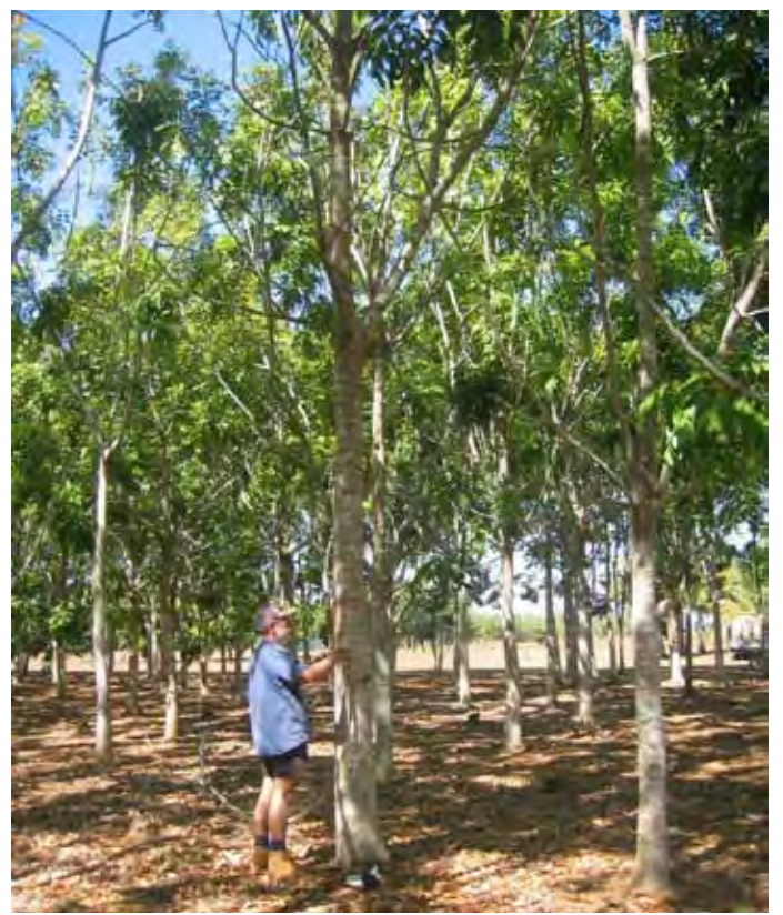
Figure 4. A rooted-cutting tree of widely-adapted clone 99 in a 7.5-year-old replicated, single-tree-plot test of government clones planted at DOR's Coastal Plains Horticultural Research Station, Northern Territory in 2005. Dbh 23.1 cm, bole length 6.5 m, straightness score 5 (6 best). D. Reilly.

Four hundred clones are under test in trials established between 2005 and 2011 across 12 sites in the NT (20) and four in Qld. All trials have rooted cuttings derived from hedge-garden seedlings of diverse NT and Qld sources, and seedling controls from local and/or African sources (Figs 4, 5). Early assessments show great variation between clones with some clones superior to controls. Across the older trials, 10 clones combining superiority for most commercial traits have been nominated; some of these clones are showing adaptability across diverse sites. These are worthy of further testing, inclusion in new grafted seed orchards and the breeding population. The new suite of promising clones is preferable to an earlier cohort chosen in tests aged up to only 1.5 years.