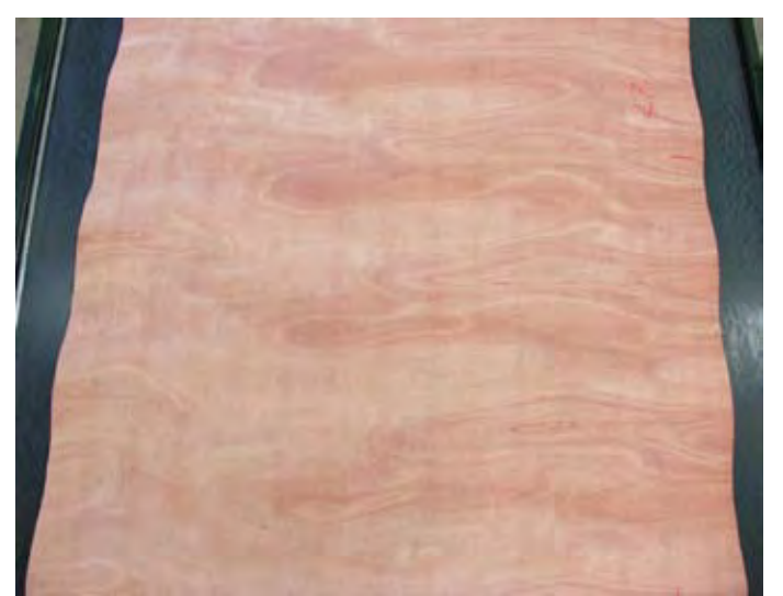
Figure 7. Veneer from a log harvested at 20 years of age from a stand at Burdekin Agricultural College, Queensland. The colour darkens on exposure. K. Harding

The benefits of sustained collaboration and pooled resources in forest tree domestication are well demonstrated in, e.g. USA-based and Australia-New Zealand-region cooperative programs. An AMIA model necessarily would be different. Collaboration in Ks domestication has been advocated frequently (16, 27, 28). Pooling all-stake-holder resources could address the recent reductions in government investment in R&D. Fortunately, there exists a cadre of Government and University researchers and support staff experienced in Ks R&D. Forming an Alliance, perhaps on the lines of the proposed subtropical tree improvement alliance (29), linking stakeholders across the whole value chain, should be canvassed vigorously.