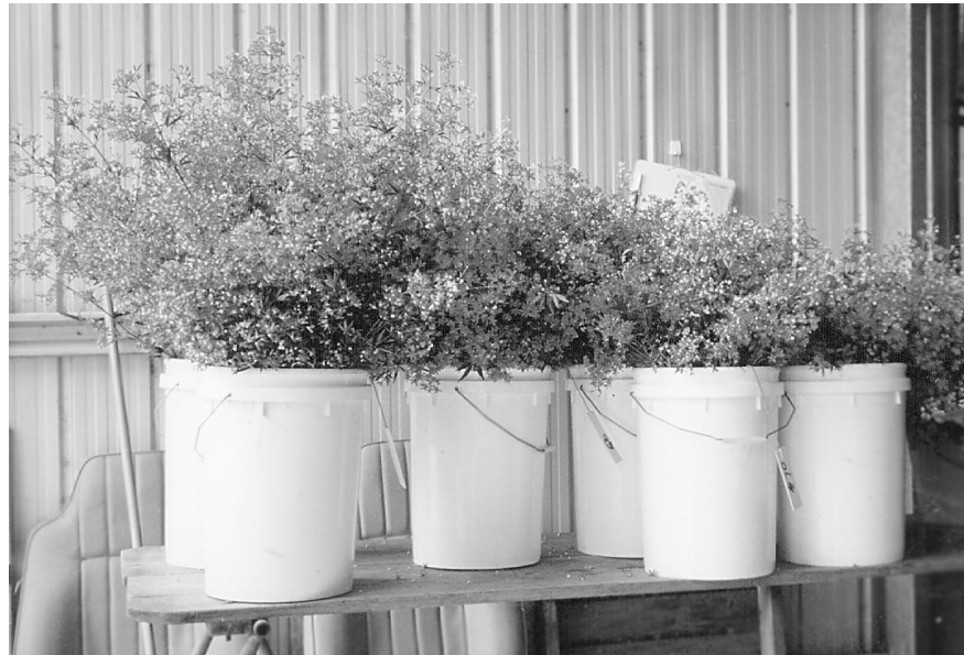
Christmas bush stays hydrated in buckets of water