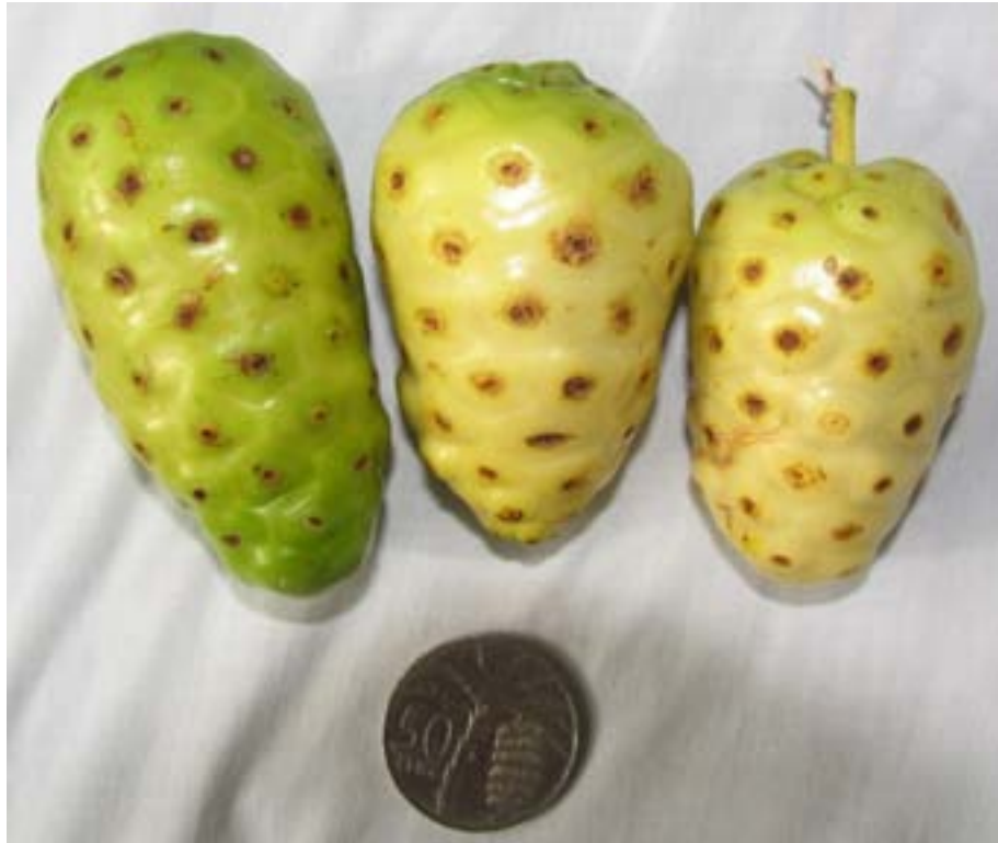
Figure 2. Fruits of Morinda citrifolia L.