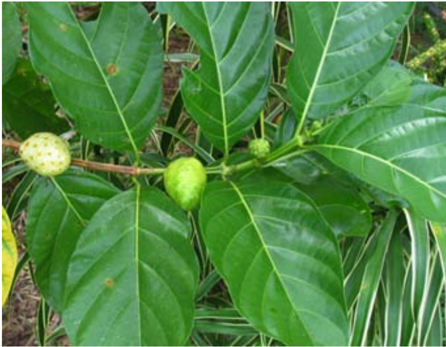
Figure 1. Morinda citrifolia L..

Plants are quite precocious – flowering within 9 months of field planting. Growth occurs throughout the year provided the growing conditions are favourable.