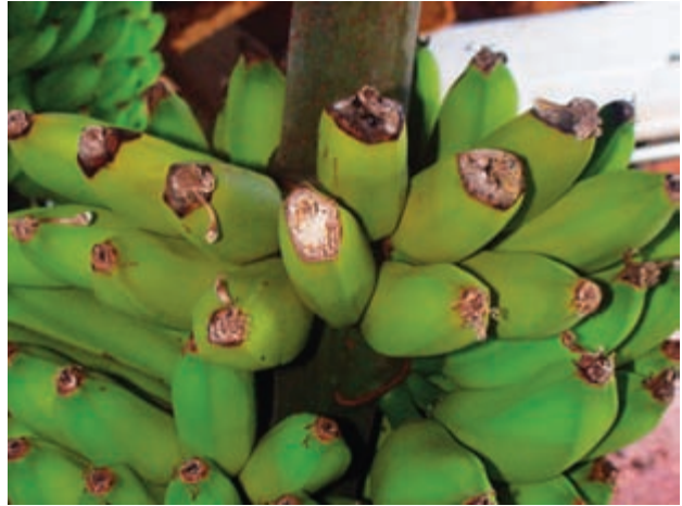
Bell injection damage