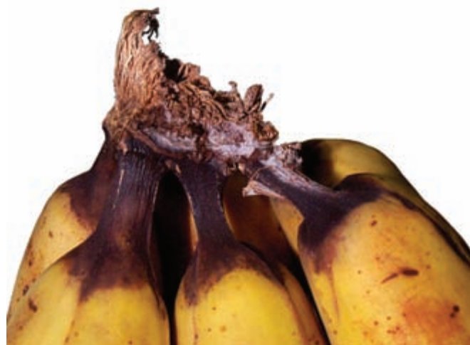
Cold weather / frost damage