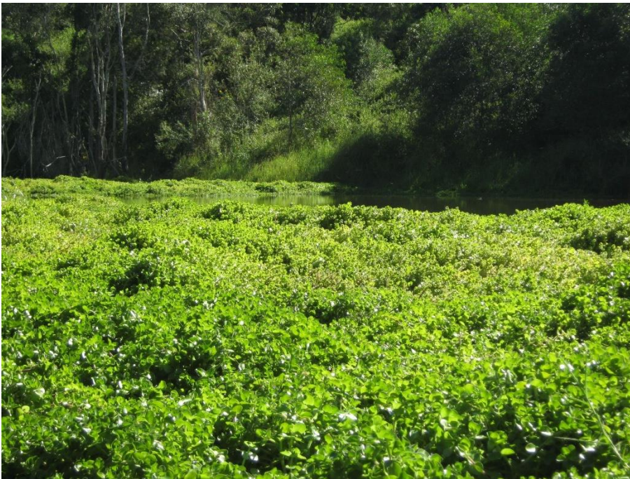
Image 3. Naturalised population of Bacopa lanigera near Cedar Creek, southeast Queensland (2009).

The first naturalised population of Bacopa lanigera in Queensland (on a property near Cedar Creek) was brought to the attention of Biosecurity Queensland in June 2009 (Image 3). However, the species had been collected previously in Cairns in 2004 (WeedSpotters Newsletter 2009). Other populations have since been detected. Several specimens held by the Queensland Herbarium were mis-identified as B. caroliniana until about 2009 (DERM 2009). It has also been recorded at Bahrs Scrub near the Gold Coast (Logan and Albert Conservation Association 2009).