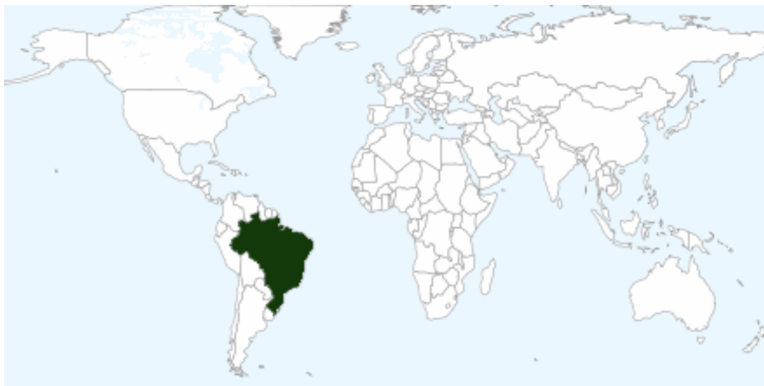
Figure 1. Countries where Bacopa lanigera specimens have been collected (MBG 2010, Tropicos.org. Missouri Botanical Garden. 07 Oct 2025 < http://www.tropicos.org/Name/29200791 >).

B. lanigera is native to South America (Brazil and Paraguay) (Figure 1). GBIF (undated) records 11 specimens collected from Brazil (Rio de Janeiro), Paraguay (Canendiyu Province) and Taiwan. This study assumes that B. lanigera is naturalised in Taiwan.