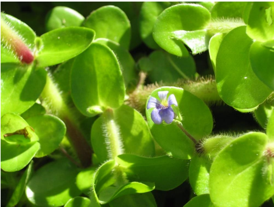
Image 2. Flower of Bacopa lanigera.

In contrast, B. monnieri has smooth stems and hairless club-shaped leaves (WeedSpotters Newsletter 2009). Both B. lanigera and B. caroliniana have hairy stems. B. caroliniana is said to be easily identified by its aromatic lemon-scented leaves when crushed (Tarver et al. 1978).