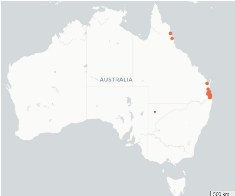
Figure 2. Records of naturalised populations of Bacopa lanigera.