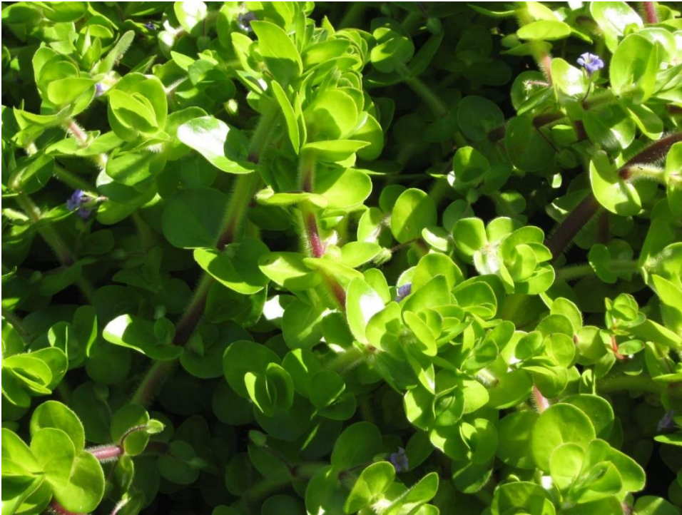
Image 1. Leaves and flowers of Bacopa lanigera.

In contrast, B. monnieri has smooth stems and hairless club-shaped leaves (WeedSpotters Newsletter 2009). Both B. lanigera and B. caroliniana have hairy stems. B. caroliniana is said to be easily identified by its aromatic lemon-scented leaves when crushed (Tarver et al. 1978).