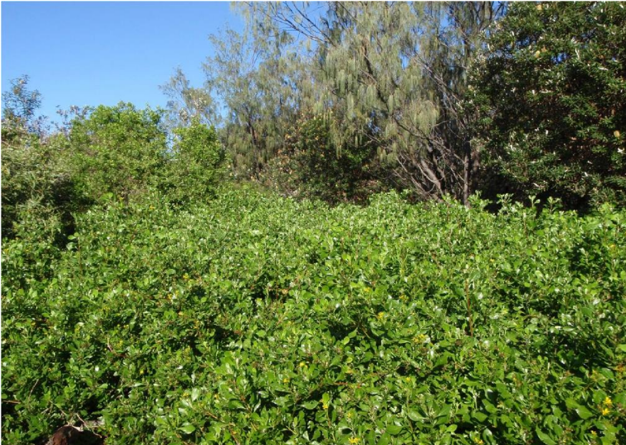
Image 2. Bitou bush growing among taller dune vegetation.

The leaves are arranged alternately along the stems. They are bright green, 20–50 mm long, semi-succulent, oval to oblong in shape and tapering at the base. They have smooth edges.