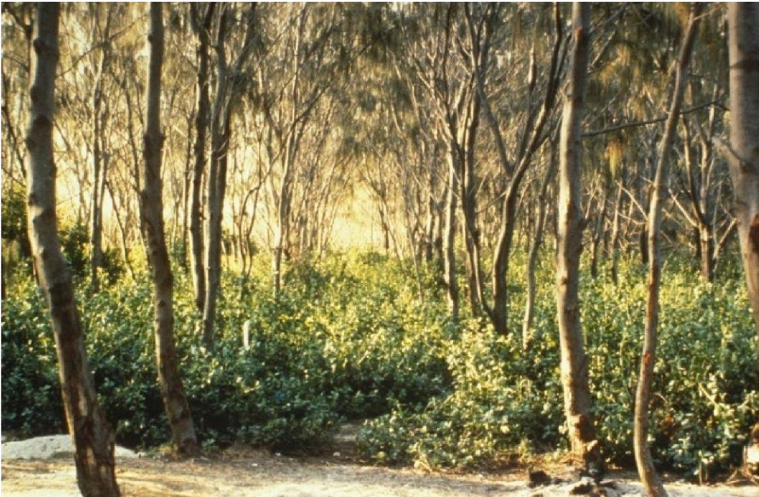
Image 7. A pure understorey of bitou bush (beneath rows of coastal casuarina) at Rainbow Beach in 1982.