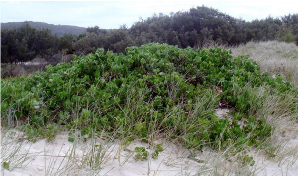
Image 1. Bitou bush on frontal dunes—when subject to strong winds, the plant adopts a prostrate habit.

Bitou bush is a perennial, evergreen, woody shrub. When exposed to harsh conditions on coastal frontal dunes it is prostrate, sometimes less than 0.5 m tall. However, when protected from strong winds, it is usually 2–3 m tall. Sometimes it reaches 6–8 m when climbing through other shrubs, such as coastal banksias.