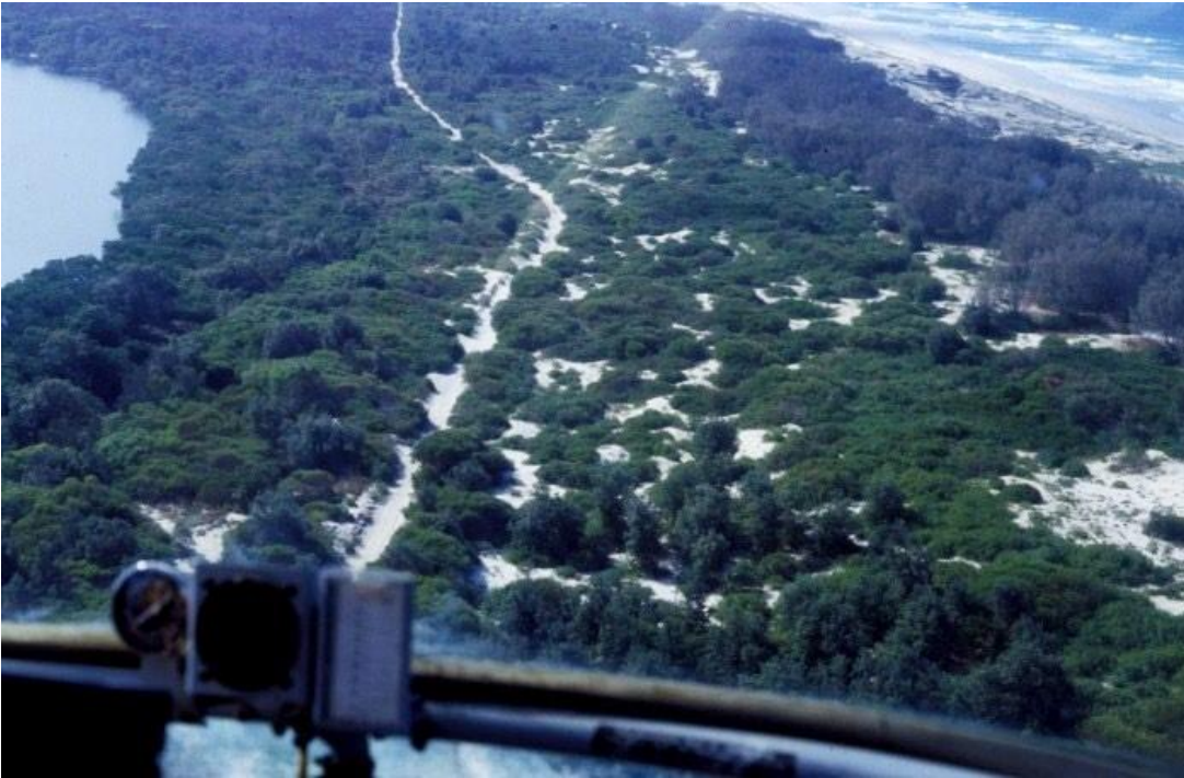
Image 5. Extensive bitou bush (the bright green plants) on South Stradbroke Island in May 1986.