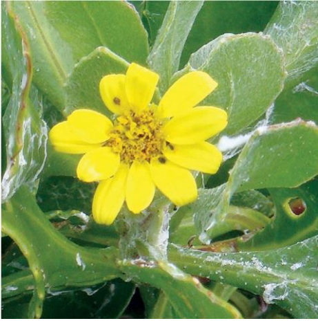
Image 3. Bitou bush flower.