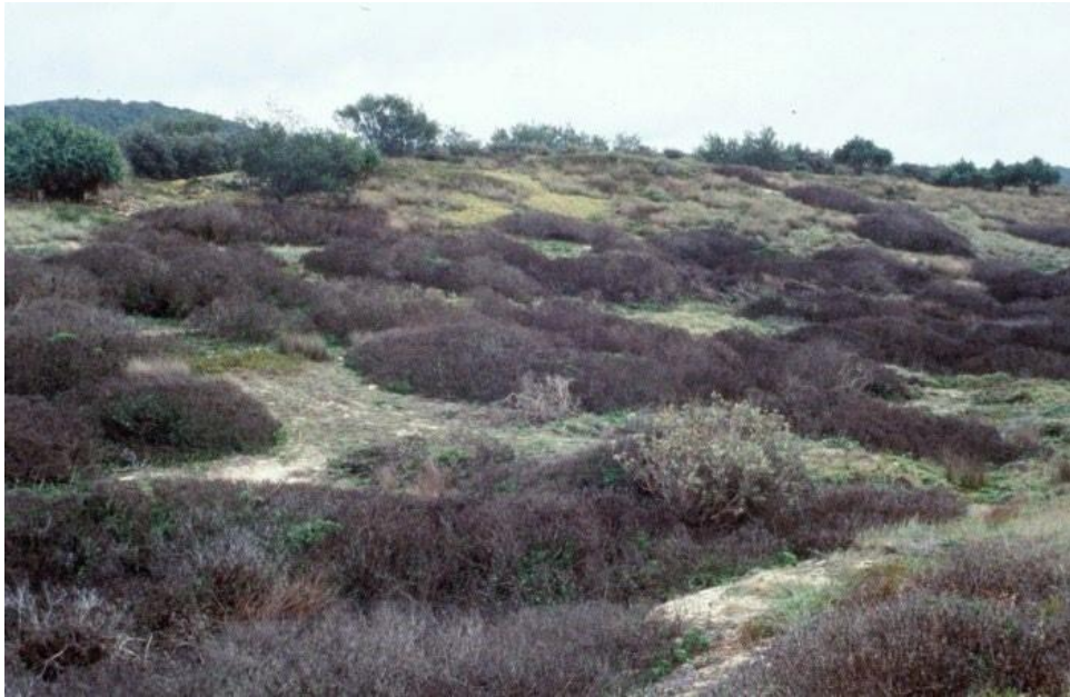
Image 10. The same site as Image 9 after initial control of bitou bush—all brown material is dead bitou bush.