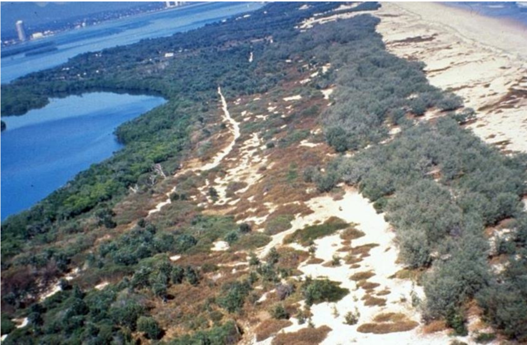
Image 6. The same area as shown in Figure 7, but with all bitou bush plants (the brown plants) destroyed by herbicide.