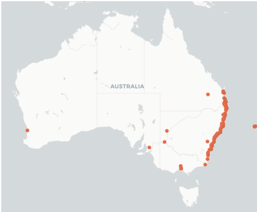
Figure 1. Records and collections of bitou bush (and boneseed) from Australian herbaria.

Bitou bush has been detected at various locations in south-eastern Queensland, including the Wide Bay area (mainly Inskip Point, Rainbow Beach and the southern tip of Fraser Island), parts of the Sunshine Coast, Moreton Island, North Stradbroke Island, South Stradbroke Island, some southern Moreton Bay islands and parts of the Gold Coast (e.g. The Spit, Burleigh Head National Park and around Currumbin).