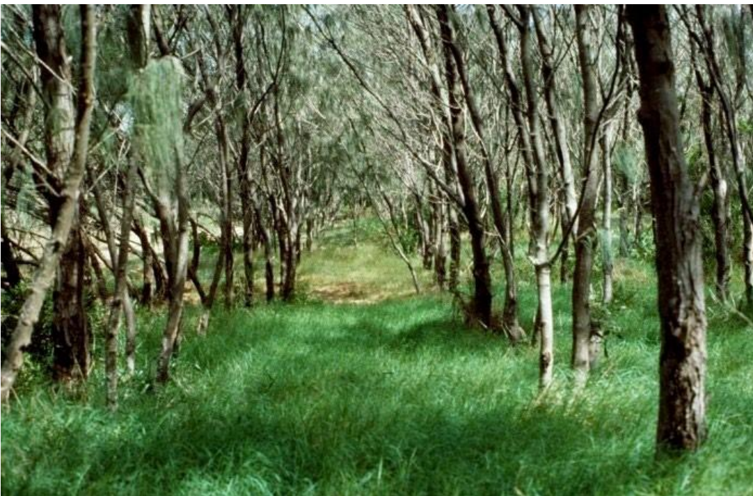
Image 8. The same area as shown in Image 7 soon after the start of an eradication campaign.

A large infestation detected on North Stradbroke Island around 1992 was initially targeted by a 'SWEEP' campaign (a short-term statewide weed-control initiative), followed by biannual search-and-destroy efforts. When the eradication program started on the island in 1992, bitou bush was well established at several locations on the island (Image 9). The population has since been dramatically reduced (Image 10).