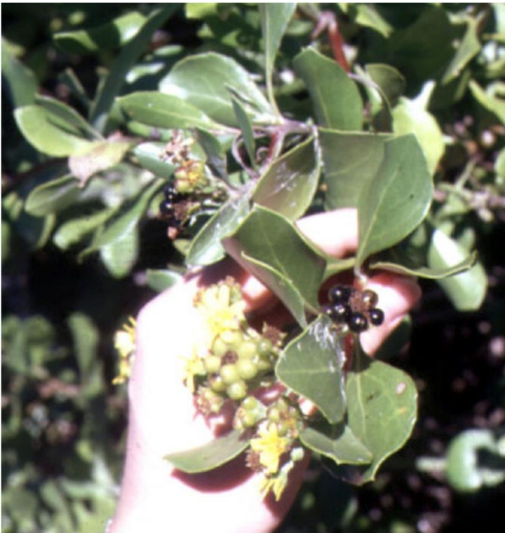
Image 4. Bitou bush fruit.