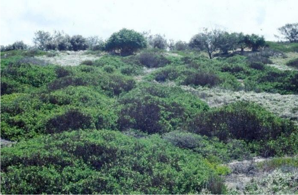
Image 9. Dense bitou bush on open frontal dunes at North Stradbroke Island in 1992.