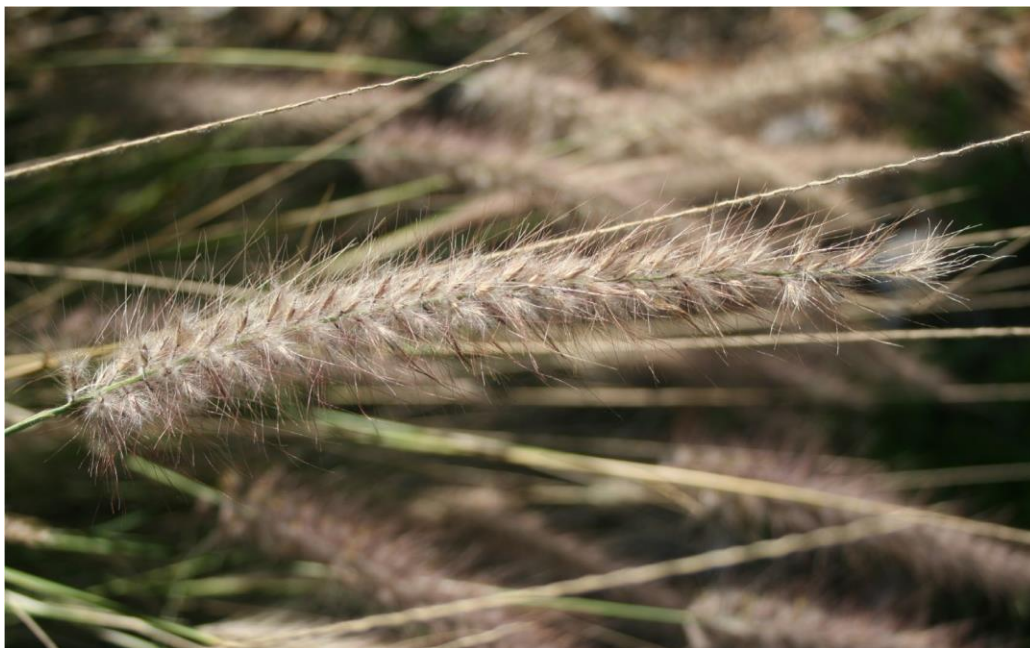
Image 2. African fountain grass raceme.