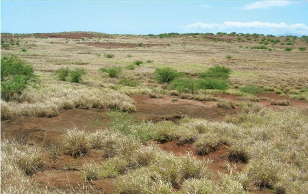
Image 3. African fountain grass dominating primary succession in Hawaii.

In South Africa, C. setaceus has invaded native vegetation and pastures in dry areas. It also contaminates seed products (Wells et al. 1986).