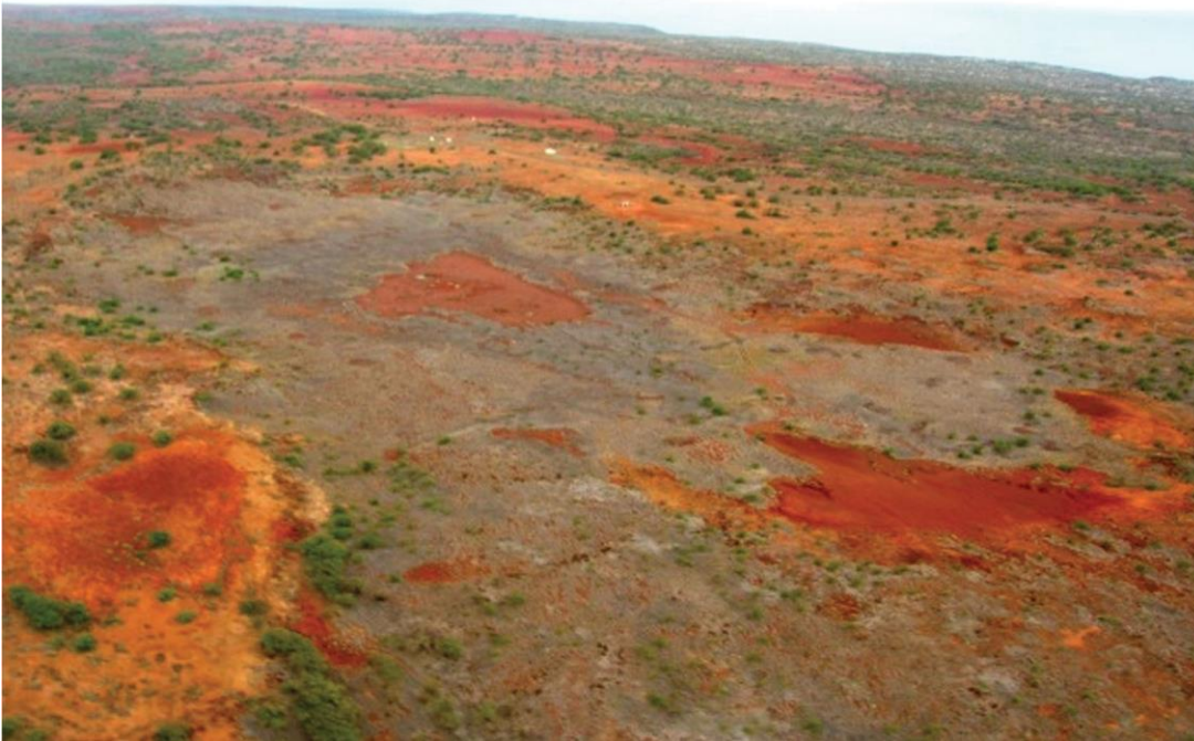
Image 4. African fountain grass (grey area) dominating primary succession in Hawaii (Source: Forest and Kim Starr CC BY 3.0).

C. setaceus is considered one of the most invasive species in Tenerife (Canary Islands), where it has invaded coastal habitats, forming pure stands, and displacing native species (Da Re et al. 2020). Up to 30% of all protected areas in the Canary Islands have been invaded by C. setaceus (González-Rodríguez et al. 2010). The plant is believed to have a symbiotic relationship with local mycorrhizal fungi, contributing to its success as an invader (Rodríguez-Caballero et al. 2018). Throughout the Canary Islands, C. setaceus is associated with an invasive leafhopper Balclutha brevis (Bella & D’Urso 2012). C. setaceus has replaced a native grass species Hyarrhenia hirta in parts of Spain (Rodríguez-Caballero et al. 2017).