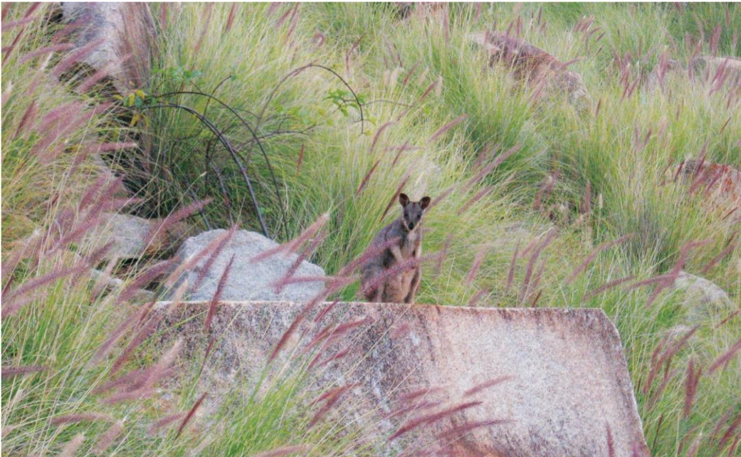
Image 6. Rock wallaby habitat near Charters Towers dominated by African fountain grass.