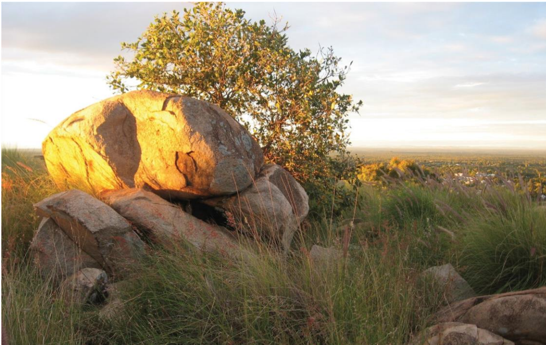
Image 7. Elevated, rocky ridges such as this site near Charters Towers, North Queensland, are at risk of invasion by African fountain grass.

Of concern is the plant's potential to increase fuel loads and fire intensity, thereby destroying or modifying native plant communities that are adapted to less intense and perhaps less frequent fires. In California, more intense fires fuelled by C. setaceus have resulted in the conversion of shrubland to grassland.