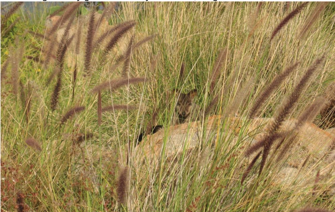
Image 5. African fountain grass dominating rock wallaby habitat near Charters Towers.

C. setaceus has been widely planted as an ornamental in Australia and overseas. In Australia, it has formed small populations over a wide range from Western Australia to the south-eastern corner of South Australia, including eastern Queensland, the greater Brisbane area and New South Wales (Hnatiuk 1990). There are few areas where it can be described as extensive. Perhaps the largest infestations in Queensland are near Mount Morgan and on mine spoil heaps near Ipswich. Near Charters Towers, African fountain grass has dominated rocky ridge lines—habitat used for day-time shelter by rock wallabies ( Petrogale assimilis ) (Images 5 and 6). It is uncertain whether it is having any negative impacts, however, as rock wallabies generally graze in nearby lowlands (Images 5 and 6).