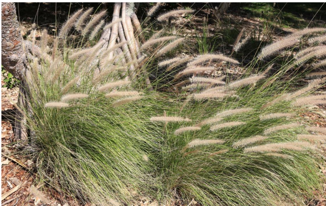
Image 1. African fountain grass in a garden.