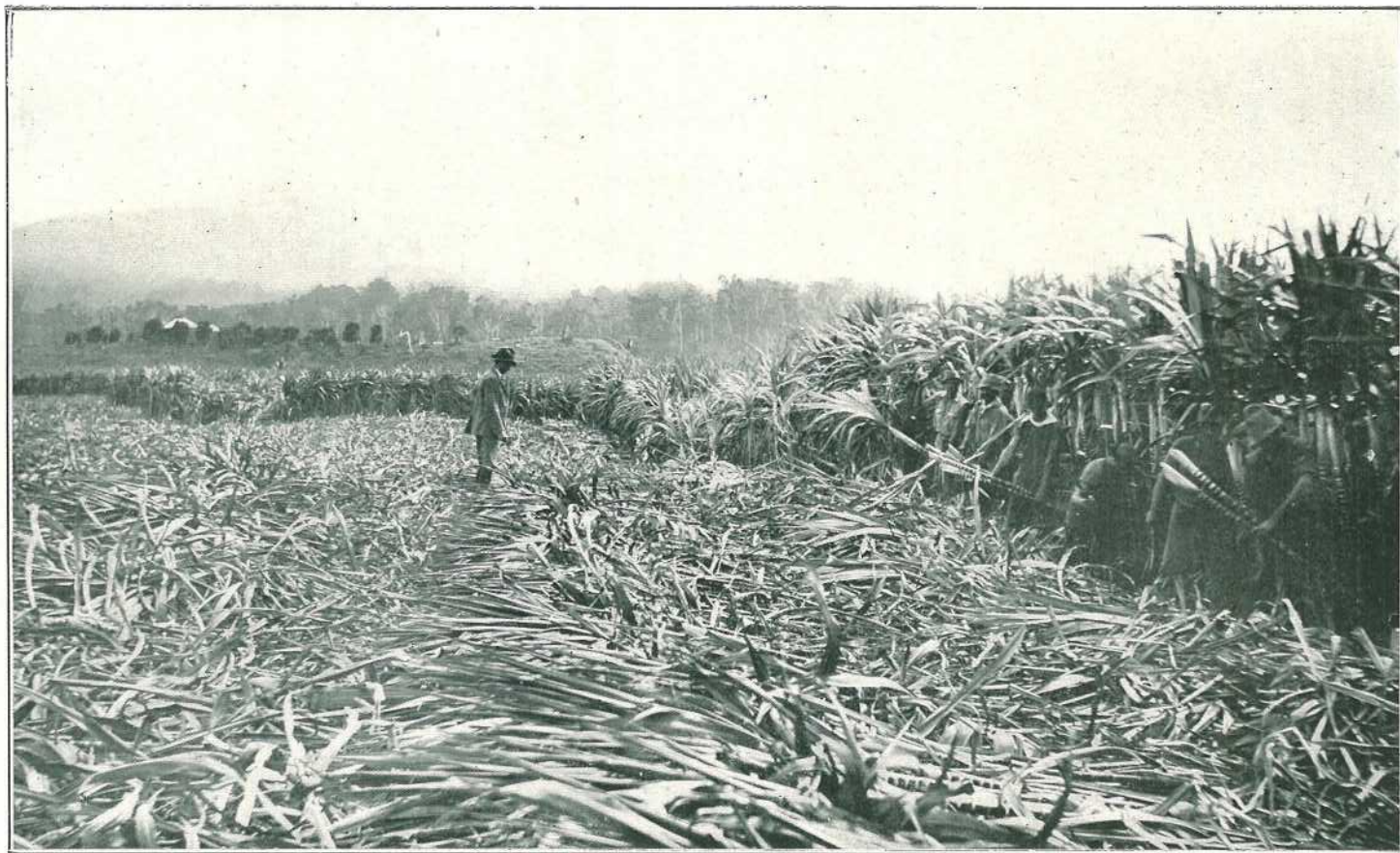
PLATE 69.—WHITE AUSTRALIAN CANE CUTTERS AT WORK, BABINDA, NORTH QUEENSLAND. The efficiency of white labour in Queensland canefields is far superior to that of any class of labour employed.