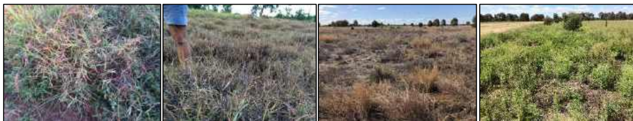
Fig. 2. Pasture dieback symptom progression. Photos left to right: Stages 1, 2, 3, 4.

Affected plants progress through four stages. 1. Initial leaf discolouration. Depending on the species, leaves can turn yellow/orange, or a combination of red and yellow, or red/purple. 2. Whole plant discolouration, unthrifty growth and sick appearance. 3. Dead patches of grass plants that are characterised by a grey appearance and are easily uprooted. 4. Broadleaf plants colonising and growing in patches/whole paddocks of dead grass.