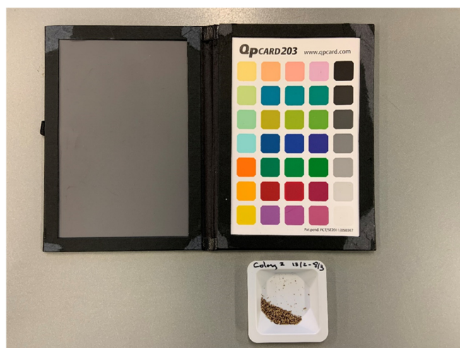
Figure 1. Sample of C. brevis frass used to measure L^* , a^* , and b^* in the CIELAB color space and the QP card used to correct for color variations.