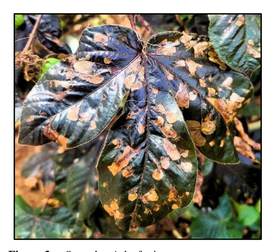
Figure 3. Stomphastis leaf mines.

Evidence of leaf-miner damage has been observed at all except one of the release sites that we have returned to (Figure 3). However, the identity of the Stomphastis species present cannot be determined visually. Stomphastis species can only be distinguished by examining internal genitalia of adults (De Prins et al. 2023). To confirm the establishment of S. thraustica , larvae will be collected from release sites towards the end of the wet season in 2025 (≥ 2 years after initial releases) for DNA analysis.