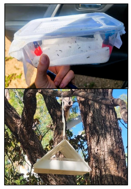
Figure 1. a. A container of adult Stomphastis thraustica for release. b. Pupal release.

Preliminary cross-mating trials Bellyache bush leaves with Stomphastis sp., larvae were collected from either Springsure (central Queensland) or Gregory (western Queensland) prior to the release of S. thraustica in the area. Leaves were placed into a partially opened décor container between sheets of moistened paper towel until larvae had pupated. Pupae were collected into individual containers and monitored for adult emergence.