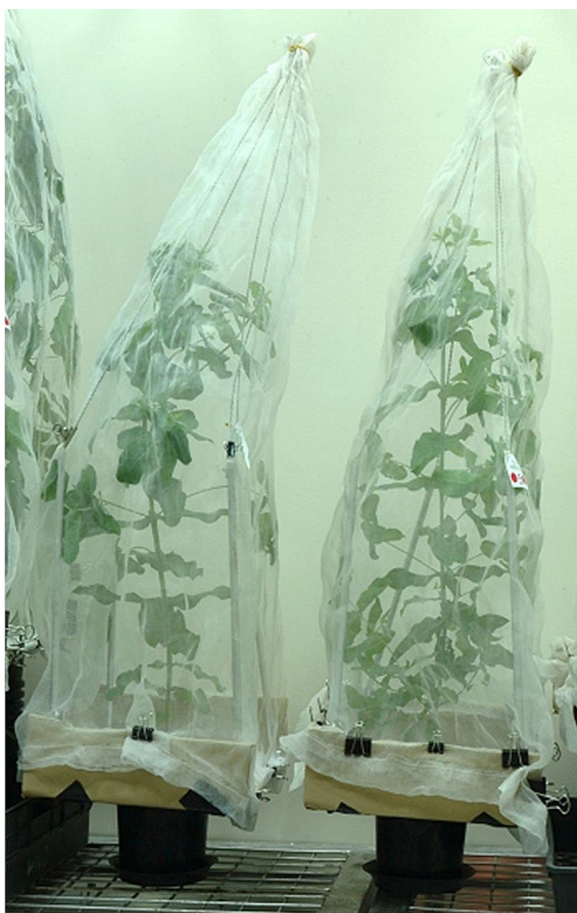
Fig. 1 Experimental set-up showing mesh cages used to contain Gonipterus weevils onto seedlings of Eucalyptus globulus allowing daily collection of frass and egg cases

Fifty to 60 \mu\text{L} aliquots of egg capsules and frass extracts from five collection days per repeat were combined to provide a single 250 to 300 \mu\text{L} sample for analysis. One repeat of egg capsule extract was excluded due to insufficient volume. The resulting blends and 30 \mu\text{L} aliquots of the leaf extracts were evaporated to dryness under a gentle nitrogen gas flow at 20 ^{\circ}\text{C} and re-suspended in hexane in one-tenth of the volume of the original extracts. A subsample of the original leaf extracts was kept prior to concentration (see Online resource 1 for work-flow diagram).