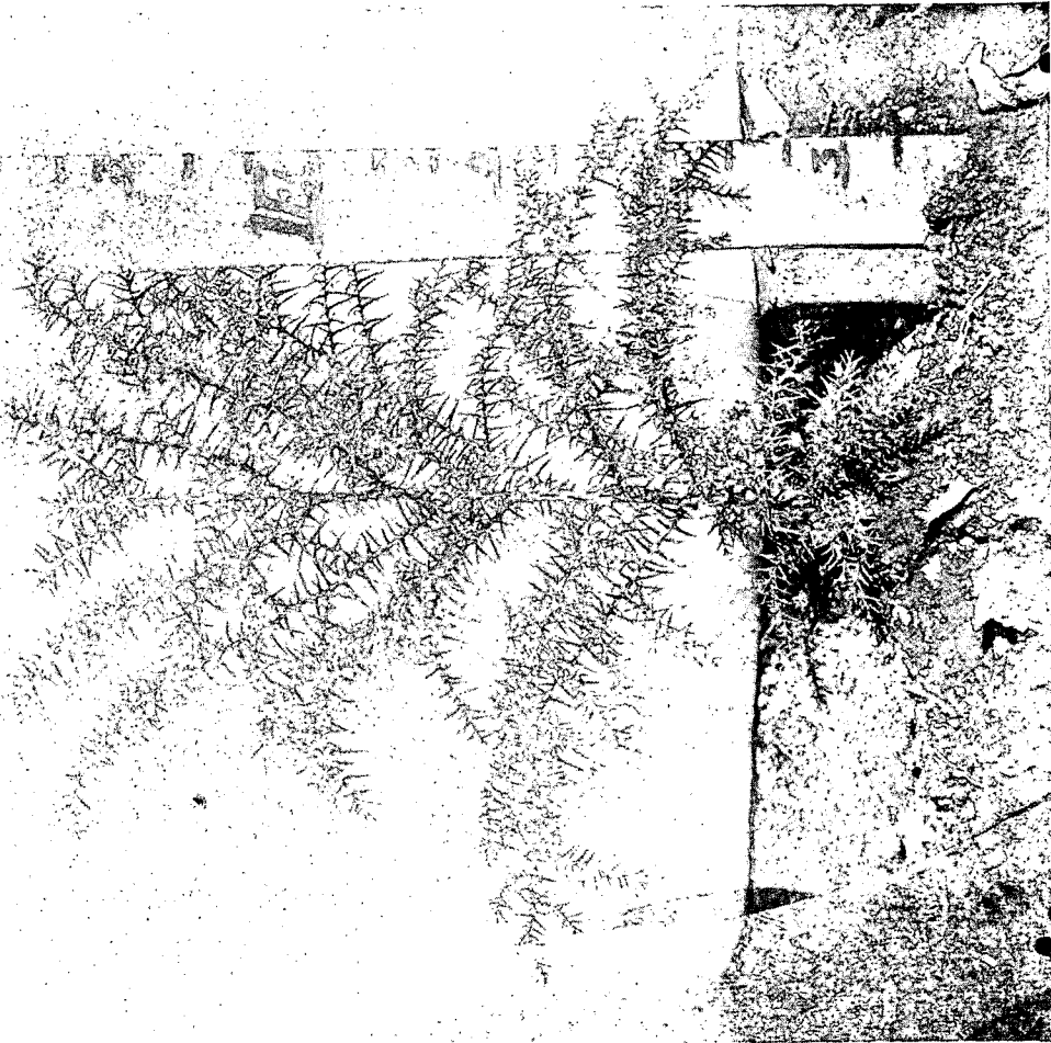
14-O Hoop Pine Seedling, Showing First Nine Months' Growth, in Plantation, Imbil.