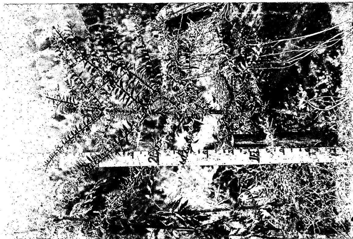
Bunya Pine, showing One Season's Growth, in Plantation, Imbil.