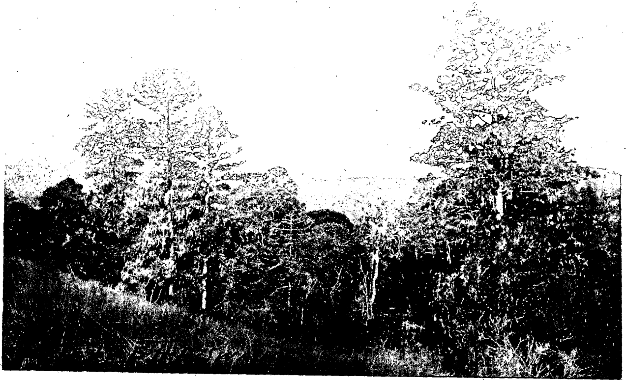
Hoop Pine Forest, Bunya Mountain.