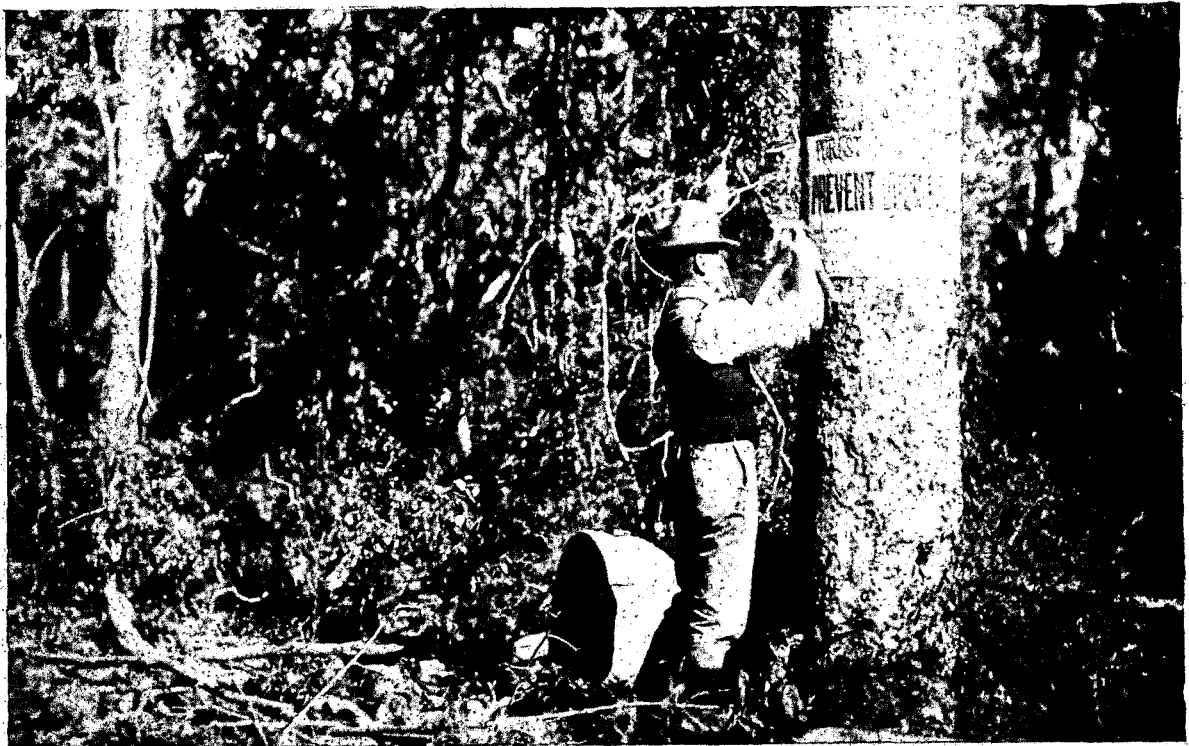
Prevent Forest Fires.