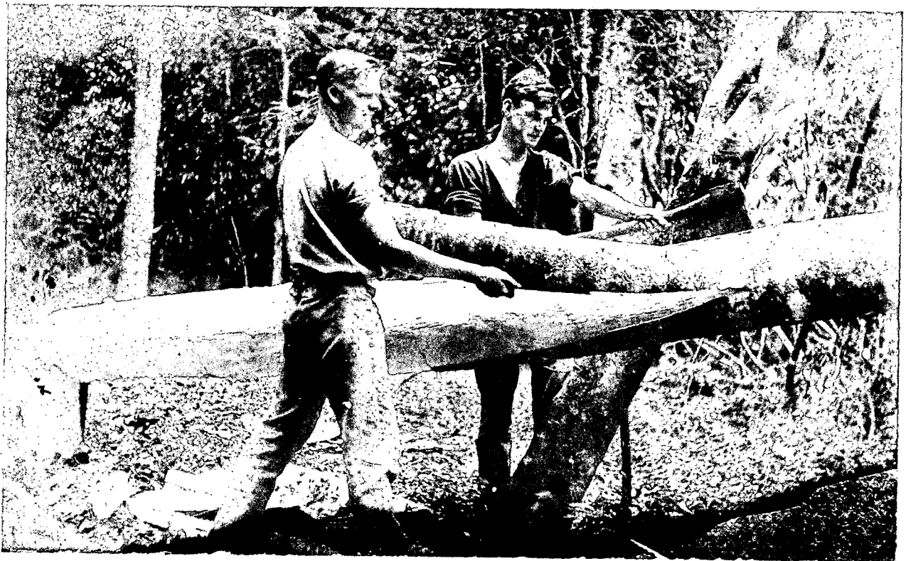
Stripping White Foam Bark.