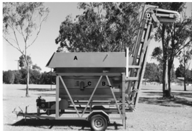
Figure 1. Side view of the weigh bin, showing the holding bin (A), digital readout (B), sample chute (C) and elevator system capable of transferring peanut to a height of 4 m (D).

The weigh bin consists of a holding bin located above a steep-angled, cleated-belt elevator used for unloading (Fig. 1, A). The bin sits on 3 load cells (Ruddweigh Millimix 15 kit) that are attached to a 12 V digital readout (Ruddweigh KM3) fitted to the side of the trailer (Fig. 1, B). The load cells have a capacity of 15 t, with a resolution of \pm 1 kg. The bin was constructed from sheet metal (2 mm), with dimensions 2670 mm long, 1600 mm high, 1880 mm wide at the top and 300 mm wide at the bottom, giving a volume of about 4 m 3 . The bin can hold nearly 1.2 t of pods when fully loaded, and is therefore large enough to receive a typical load from most commercial threshers used in Australia and overseas. The sides of the 'V'-bottom bin are built at a slope of 40 degrees