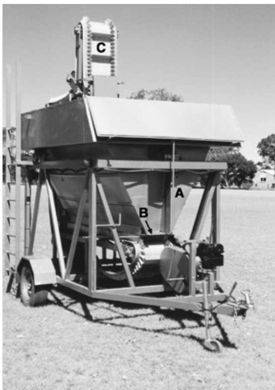
Figure 2. Front view of the weigh bin, showing the ‘V’-bottom bin (A), wind-out sliding door (B), elevator belt folded in transport position (C).

so the peanuts will readily fall to the unloading point at the base of the bin (Fig. 2, A). Unloading of pods can be controlled using a windout sliding door (Fig. 2, B). A 150-mm-diameter chute is also located on the side of the bin so that a subsample can easily be obtained from the load (Fig. 1, C).