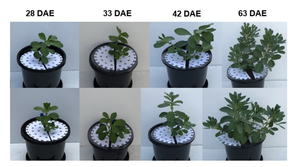
Figure 2. Growth comparison of cultivars PBA Nanu (top) and PBA Zahra (bottom) at four different sampling times at Toowoomba, QLD site. (DAE = Days after emergence).