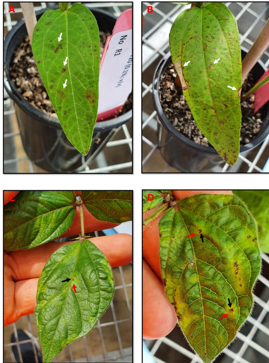
Figure 1. Examples of mungbean leaves, cultivar Berken, showing halo blight symptoms. On the cotyledons, symptoms initially appear as irregular shaped spots scattered throughout the tissue ((A) picture collected 6 days after inoculation). These can join, causing large, irregular-shaped chlorotic lesions ((B) picture collected 12 days after inoculation). On the trifoliolate leaves, initial symptoms appear as regular-shaped, water-soaked circular spots surrounded by large chlorotic margins ((C) picture collected 6 days after inoculation). These develop large necrotic lesions by about 12 days after inoculation (D). White arrows in A and B indicate the presence of chlorotic tissues. Black and red arrows in C and D indicate the presence of necrotic and water-soaked lesions, respectively.

rain and hail; these are thought to trigger a widespread pathogenic shift [2]. Therefore, movement of equipment through and between paddocks should be carefully considered, as symptomless mungbeans can harbour the pathogen. Mechanical damage and physical movement may spread the disease across the paddocks [3]. Growers and agronomists should implement a ‘come clean-go clean’ approach, which has proven successful in many other crops such as cotton [4]. Vehicles and machineries should be properly cleaned before leaving one paddock so that they arrive clean at the next paddock.