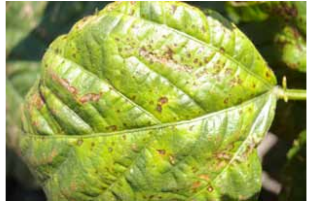
Halo blight symptoms on leaf