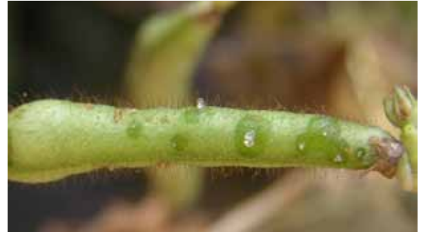
Halo blight lesions and ooze on pods

Symptoms develop rapidly if the crop is subjected to adverse growing conditions, such as heat or moisture stress.