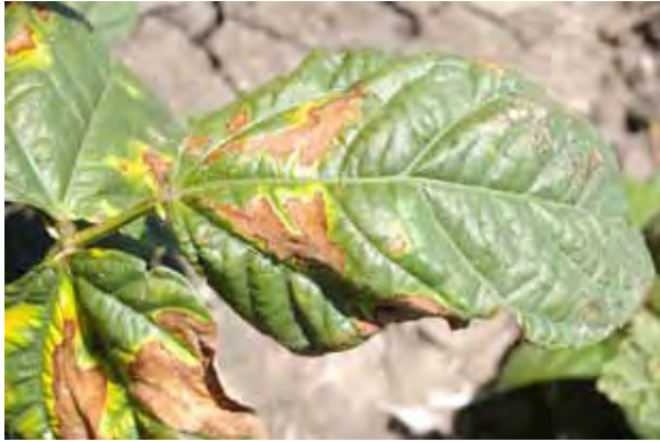
Tan spot lesions on mungbean leaf