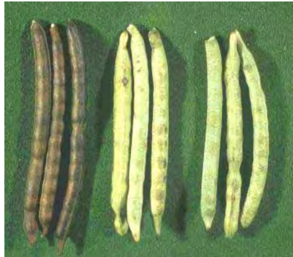
Puffy pod disorder—normal pods (left) vs puffy pods

symptoms of the disorder. Seeds in infected pods do not mature properly, often turn brown, and may develop secondary rots.