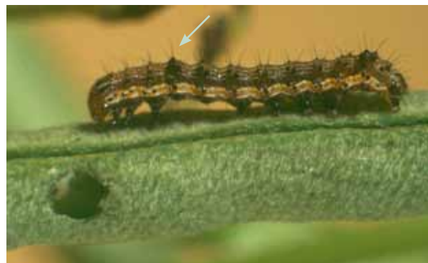
Helicoverpa armigera larva (medium—12 mm) with diagnostic dark saddle