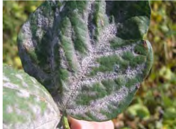
Colonies of powdery mildew on upper leaf surface

Conditions favouring development: Favoured by cooler conditions, and is often widespread in late-planted crops. The fungus survives on other living hosts, and is spread by wind. Infection becomes apparent during February, and usually increases in severity during March and April. Significant yield loss can occur if powdery mildew develops before or at flowering, particularly if the crop is under moisture stress.