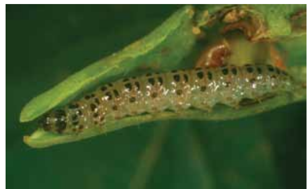
Bean podborer larva (large, 16 mm)