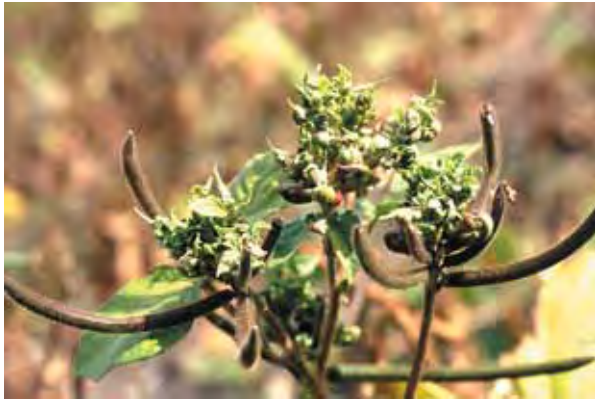
Little leaf virus on mungbean

promote the movement of leafhoppers from infected weeds to mungbean crops.