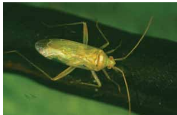
Adult green mirid