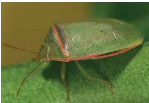
Redbanded shield bug (female, 9 mm)

Damage: Both large and small brown bean bugs are equally damaging and are as damaging as GVB.