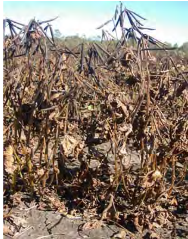
Desiccated mungbeans ready for harvest

The rate of dry-down of the crop will depend on the choice of desiccant product, rate used and temperature and moisture conditions. Wait for maximum dry-down of leaf and stem moisture, which can take 5–6 days with diquat and 7–16 days for glyphosate.