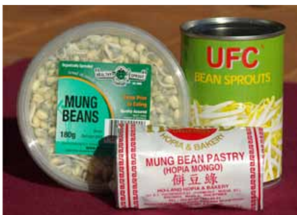
Mung dahl (top) and retail products (below)

obvious in December when harvest of the Chinese crop nears completion and both the volume and quality of production in that country is more apparent.