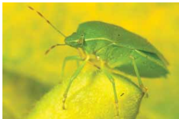
Green vegetable bug (normal adult)

Damage: Pods most at risk are those containing well-developed seeds. GVB also damages buds and flowers but mungbeans can compensate for this early damage. Damage to young pods causes