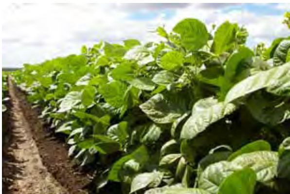
Furrow irrigated mungbean crop

budding has been found to be most cost-effective in many situations.