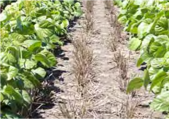
Mungbean is a useful crop for controlling grass weeds

morning, late afternoon or at night. See the label for registered use pattern in mungbeans.