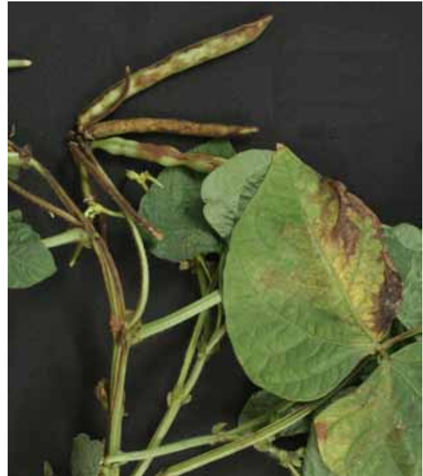
TSV symptoms on leaves, stem and pods

Conditions favouring development: Thrips are the only known vector of TSV through the transmission of virus-infected pollen. Several common broadleaf weed species are hosts of TSV, with parthenium