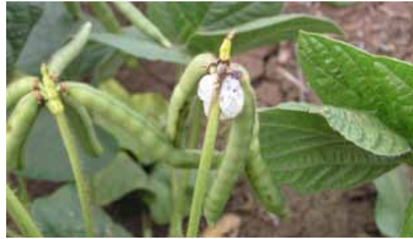
Gummy pod—foaming on pod

Symptoms: Pods develop a blotched, puffy appearance. In the most severe cases, up to 50% of the pods within affected crops may display