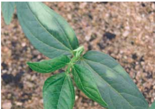
Early symptoms of tan spot lesions on a seedling