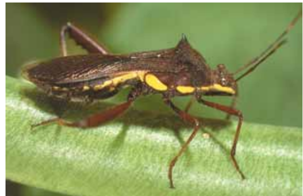
Large brown bean bug (female Riptortus , 16 mm)