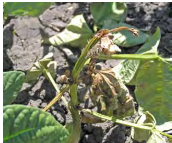
Mungbean plant affected by TSV