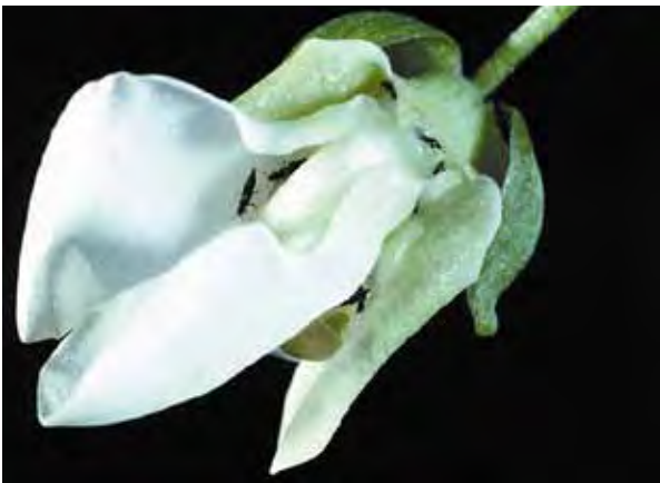
Check inside flowers for thrips

store in 70% alcohol to dislodge thrips and prevent thrips escaping.