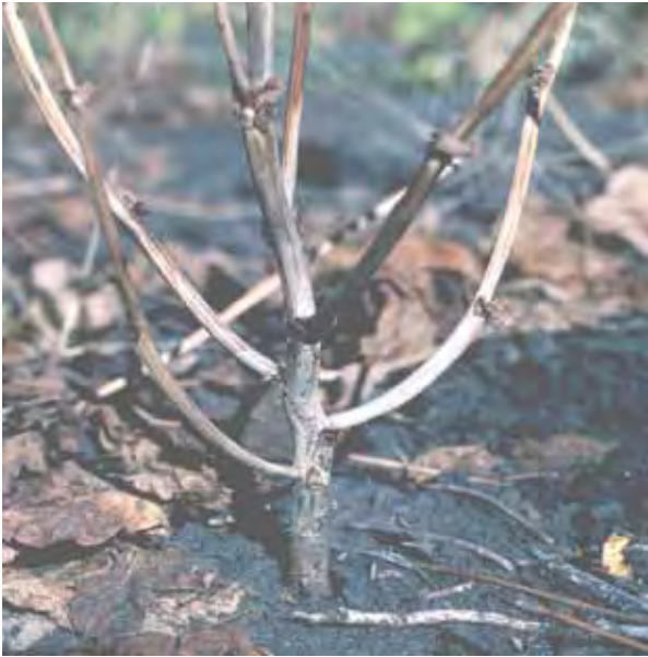
Ashy-grey stem of plant infected with charcoal rot

By contrast, evidence suggests that seed infection occurs during rain periods, when microsclerotia are splashed from the soil surface onto developing pods. The disease can be particularly severe after sorghum, but stress at, and after, flowering is the key driver.