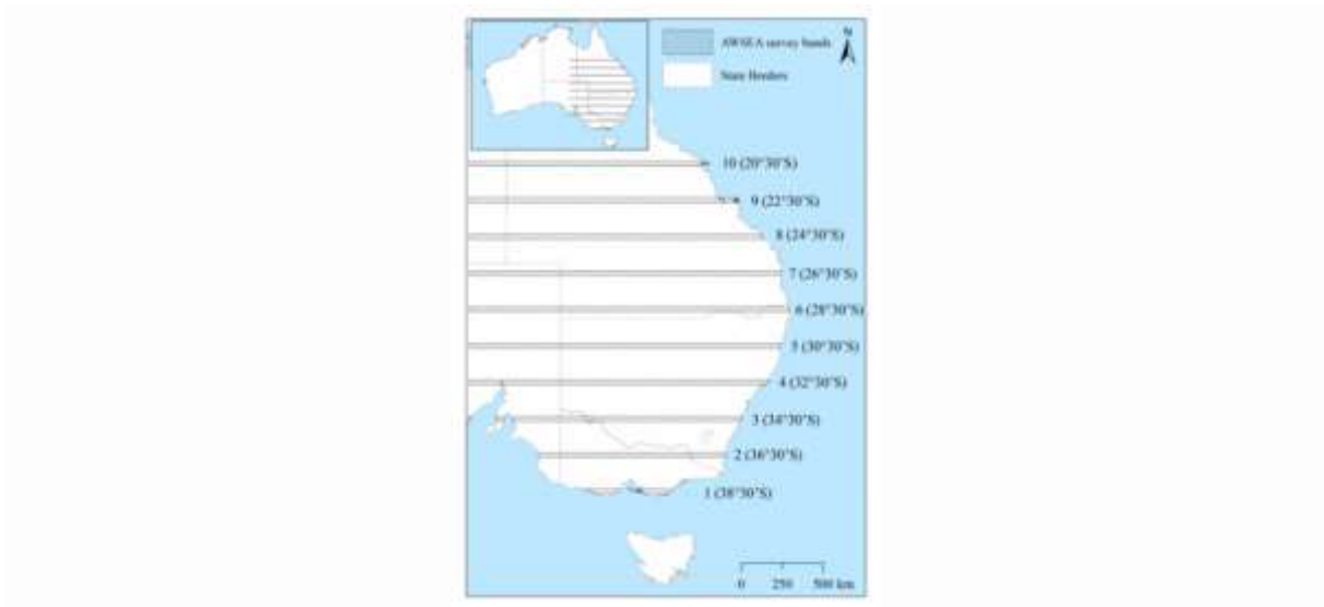
Figure 1. Ten aerial survey bands (each 30 km in width), every two degrees of latitude, crossing eastern (UNSW, 2018)