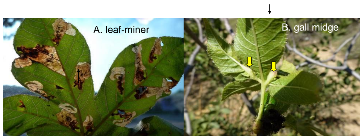
Figure 2. Damage by the leaf-miner (A) Peru and the gall-midge (B) in Bolivia.