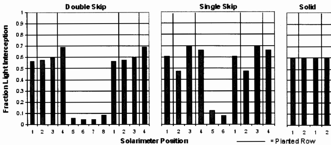
Figure 2. Effect of row configuration on light interception (Experiment 3).