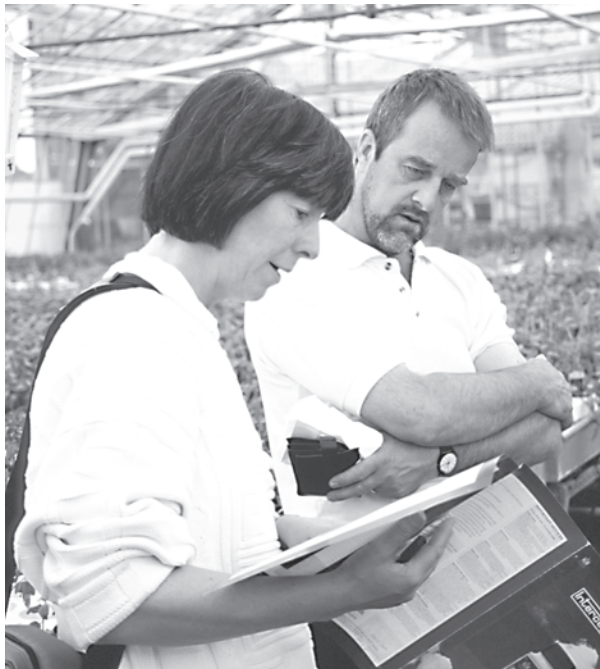
Consultant (left) passing on information to a grower