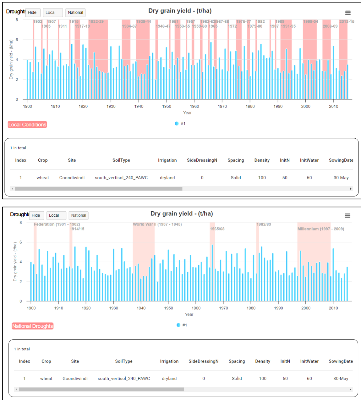
Figure 1. A local and national drought analysis performed in CropARM for wheat grown at Goondiwindi. The top panel shows the analysis overlaid with local drought conditions (shaded), while the lower panel shows the analysis overlaid with national drought conditions (shaded).