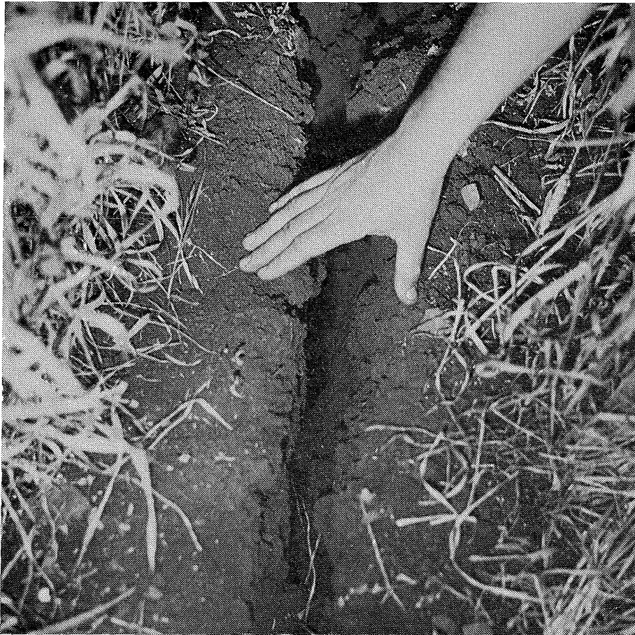
Fig. 1.—Induced linear cracking in a wheat crop at maturity.

In the initial investigation with 5 ft of wet soil at planting, minor cracking became evident in the surface layers throughout the area in the mid-vegetative growth stages. In control plots, as crop growth progressed, this cracking enlarged into the typical random crack network. A continuous crack developed along the axis of the bare area in treated plots and rapidly increased in size as crop development proceeded. Figure 1 shows a typical linear induced crack in a treated plot at crop maturity.