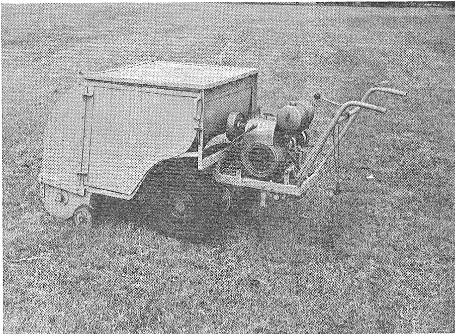
Fig. 1.—General view of harvester ready for use.

The cutting head and cover, obtained from a "Howard 2000" flail mower, are bolted to the frame, which is fabricated from 5 cm \times 2.5 cm R.H.S. steel. Cut material is blown directly into the sample bin located behind the cutting