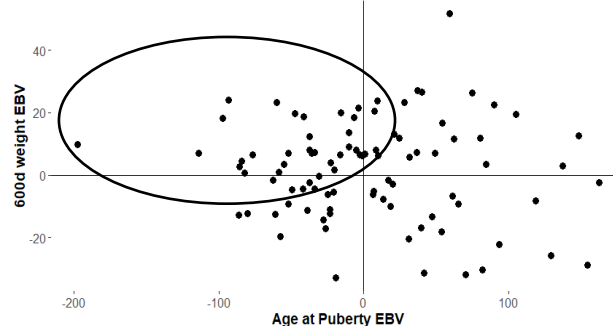
Fig. 2. Relationship between sire EBVs for age at puberty and 600d weight EBVs.

Fig. 1 displays a strong positive relationship between the sire's EBV showing that as age at puberty EBV increases, so does the EBV for the weight of the heifer at puberty. This indicates that those sires with daughters that were older at puberty were also likely to have heifers that were heavier at puberty. Conversely, younger age at puberty would be associated with lighter pubertal weight. However, Fig. 2 shows there was no observed relationship between 600 dW EBV and AP EBV and identifies sires (in the circle) that have early age at puberty as well as above average 600 dW. Further analyses could confirm these relationships through the estimation of genetic correlations between the traits allowing for development of multi-trait evaluations. The study could be expanded to estimate the relationship with other traits such as heifer fatness and body condition.